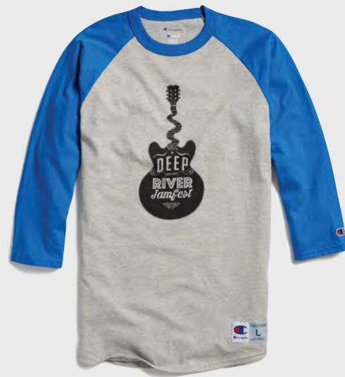
T137 Raglan Baseball T-Shirt

The 100% cotton classics that never go out of style.