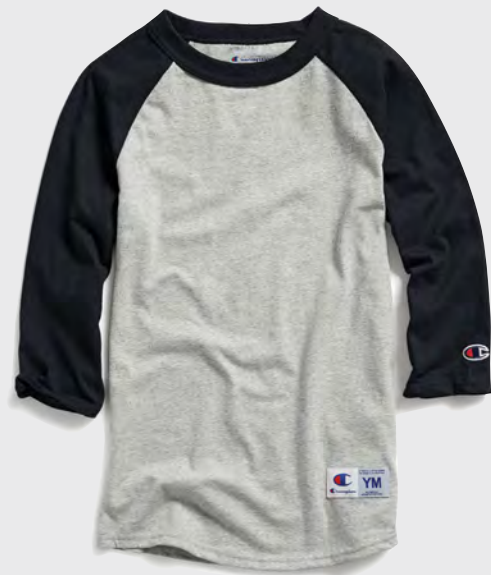
T13Y Youth Raglan Baseball T-Shirt