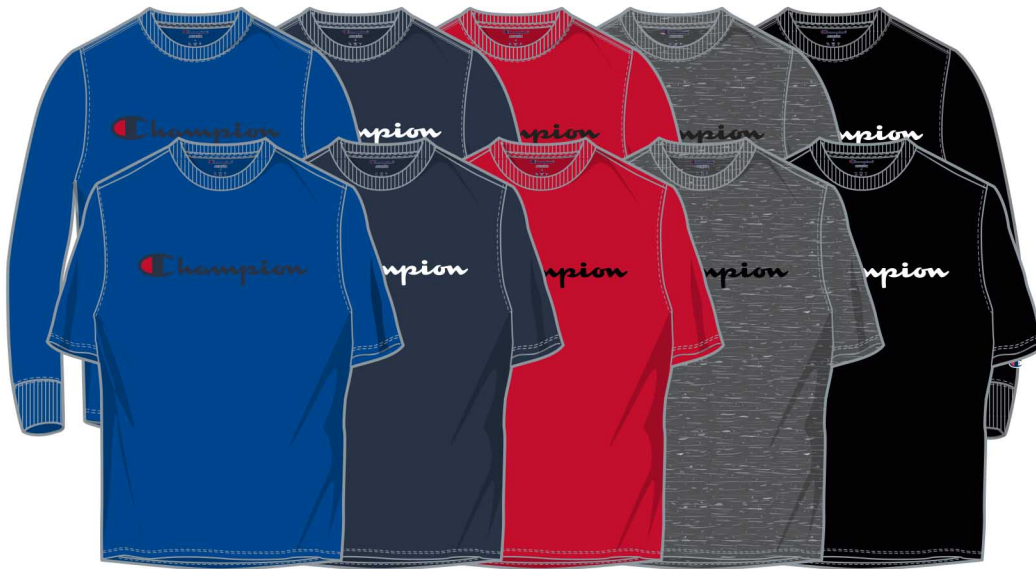
SURF THE WEB (Y06794) CH327SS/CH327LS NAVY (Y06794) CH327SS/CH327LS SCARLET (Y06794) CH327SS/CH327LS GRANITE HEATHER (Y06794) CH327SS/CH327LS BLACK (Y06794) CH327SS/CH327LS

CH327 SS/LS CH328 SS/LS CH329 SS/LS (GT280 = SS Tee) (GT286 = LS Tee) GRAPHIC TEE