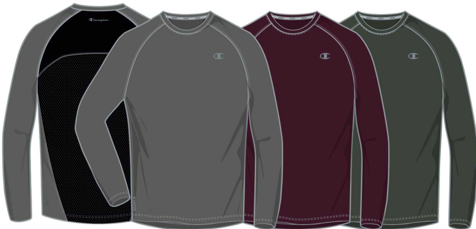
SHADOW GREY/ BLACK