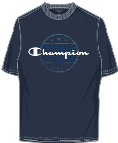
NAVY CH330 (Y06790)