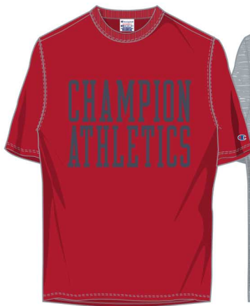
FIRE ROASTED RED CH326 (549523)