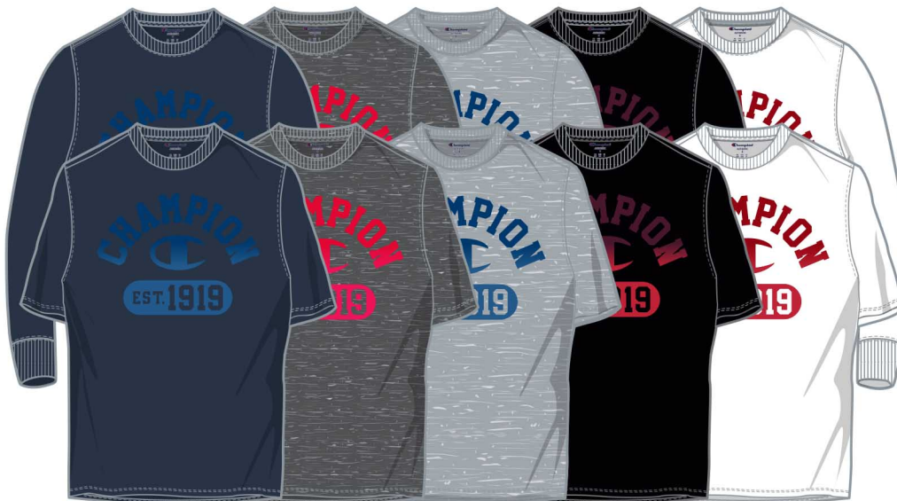
NAVY (Y06802) CH328SS/CH328LS GRANITE HEATHER (Y06802) CH328SS/CH328LS OXFORD HEATHER (Y06802) CH328SS/CH328LS BLACK (Y06802) CH328SS/CH328LS WHITE (Y06802) CH328SS/CH328LS

CONTENT BY %: Solid: 100 Cotton Oxford Heather: 90 Cotton, 10 Poly Granite Heather: 60 Cotton, 40 Poly