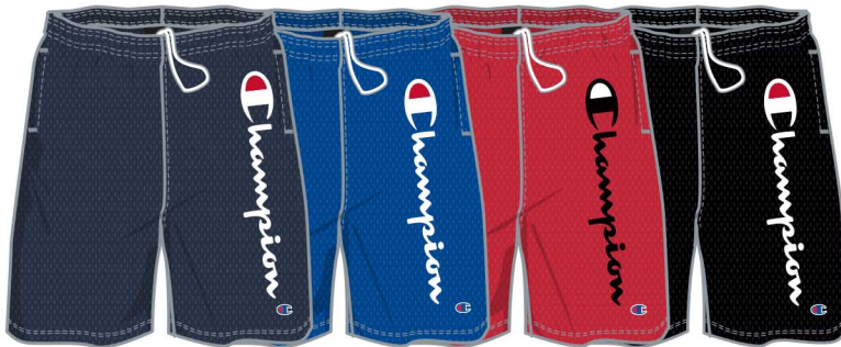
NAVY CH515 (549548)