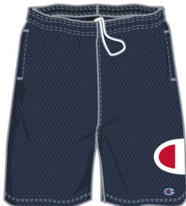
NAVY CH516 (549553)