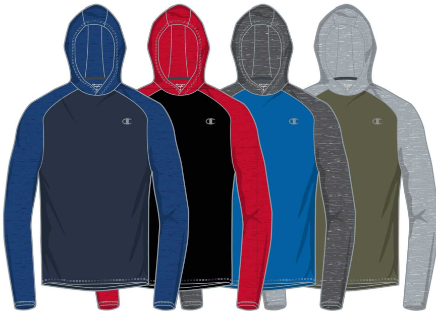
NAVY/SURF THE WEB HEATHER BLACK/SCARLET HEATHER RUNNING WAVES/GRANITE HEATHER CARGO OLIVE/OXFORD HEATHER