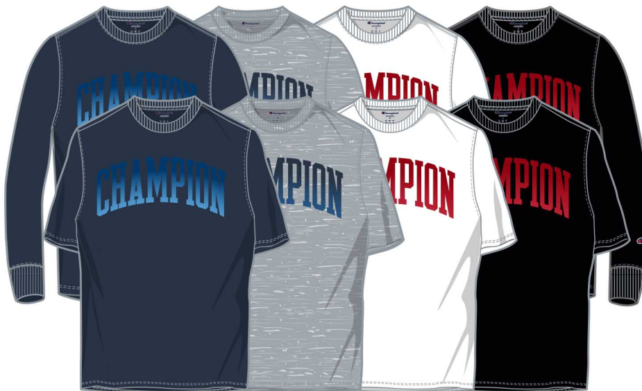
NAVY (Y06798) CH329SS/CH329LS OXFORD HEATHER (Y06798) CH329SS/CH329LS WHITE (Y06798) CH329SS/CH329LS BLACK (Y06798) CH329SS/CH329LS