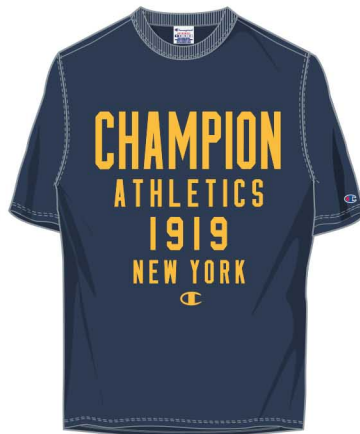
ANCHOR SLATE CH325 (549524)