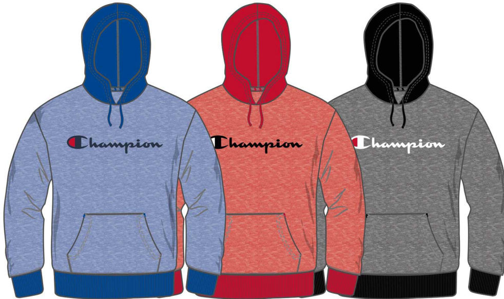
SURF THE WEB BLEND/ SURF THE WEB