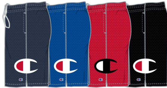
SURF THE WEB CH516 (549553)