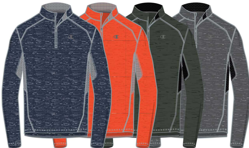
NAVY HEATHER/ CONCRETE