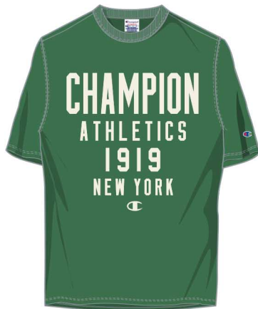
DILL GREEN CH325 (549524)