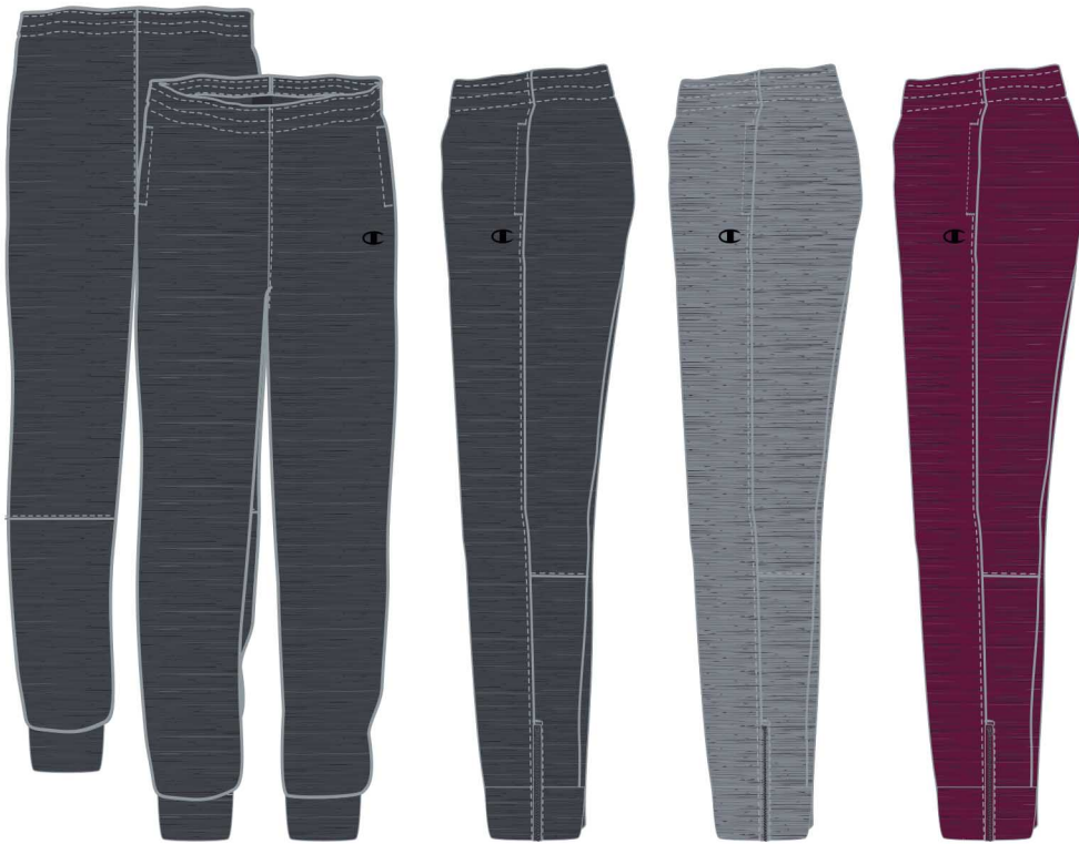
STEALTH HEATHER SPACE DYE CONCRETE HEATHER SPACE DYE BORDEAUX RED HEATHER SPACE DYE