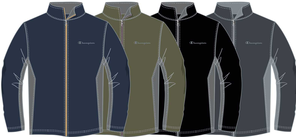
NAVY/ STORMY NIGHT/ GOLD