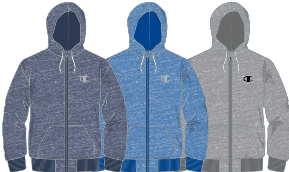
NAVY BLEND/ NAVY