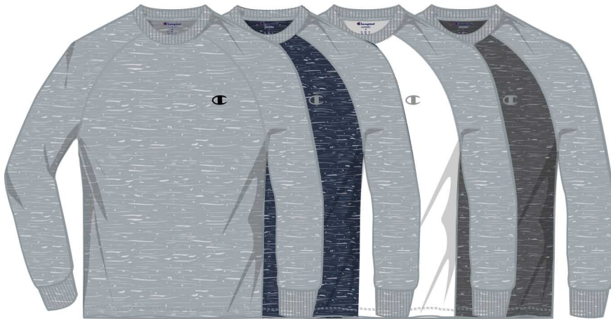
OXFORD HEATHER CHAMP NAVY HEATHER/OXFORD HEATHER WHITE/OXFORD HEATHER GRANITE HEATHER/OXFORD HEATHER