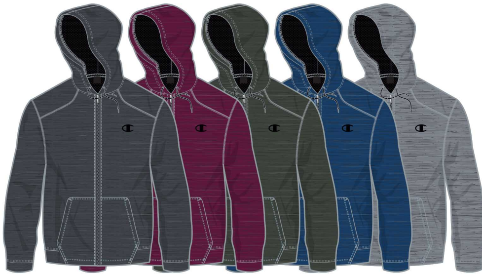
STEALTH HEATHER SPACE DYE/BLACK BORDEAUX RED HEATHER SPACE DYE/BLACK FOREST GROVE HEATHER SPACE DYE/BLACK WINTER RIVER HEATHER SPACE DYE/BLACK CONCRETE HEATHER SPACE DYE/BLACK