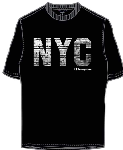
BLACK CH331 (Y06791)