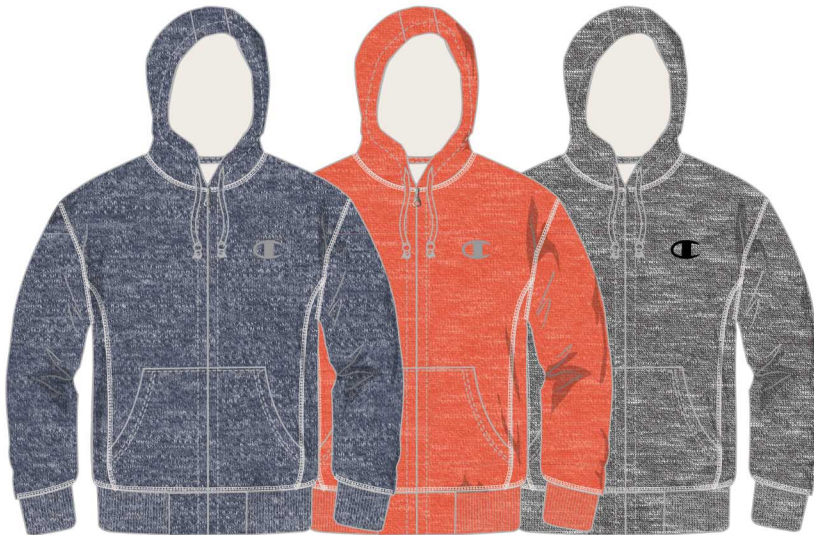
NAVY HEATHER RED GLOW HEATHER STORMY NIGHT HEATHER