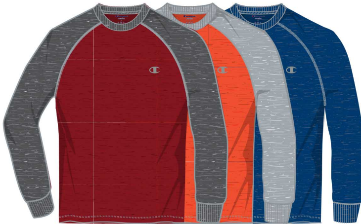
*CARMINE RED HEATHER/GRANITE HEATHER ORANGE HEATHER/OXFORD HEATHER *WINTER RIVER HEATHER