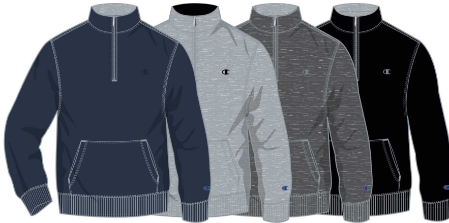
NAVY OXFORD HEATHER GRANITE HEATHER BLACK