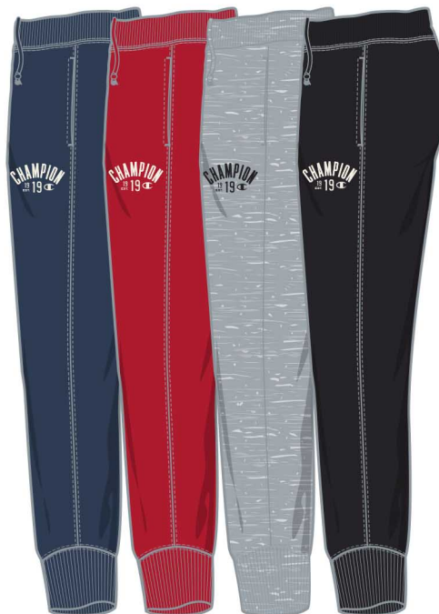
ANCHOR SLATE FIRE ROASTED RED OXFORD HEATHER GREY SCARF