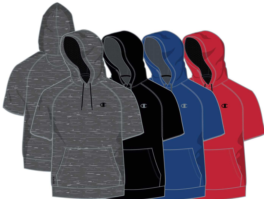
GRANITE HEATHER/ BLACK