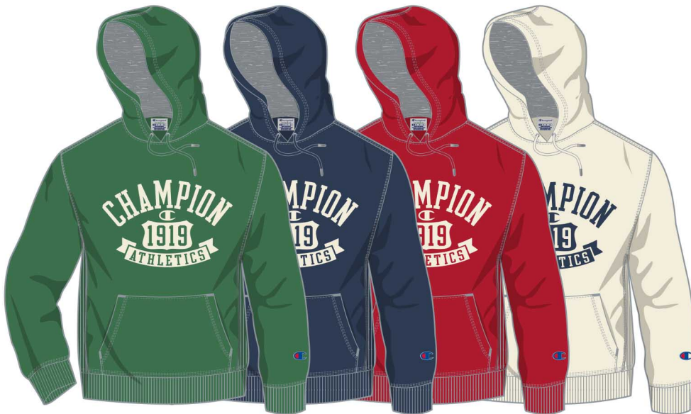
DILL GREEN ANCHOR SLATE FIRE ROSATED RED WHITE ALABASTER