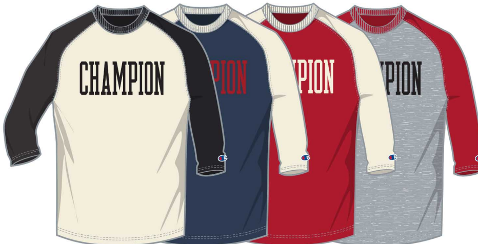
WHITE ALABASTER/ GREY SCARF ANCHOR SLATE/ WHITE ALABASTER FIRE ROASTED RED/ WHITE ALABASTER OXFORD HEATHER/ FIRE ROASTED RED