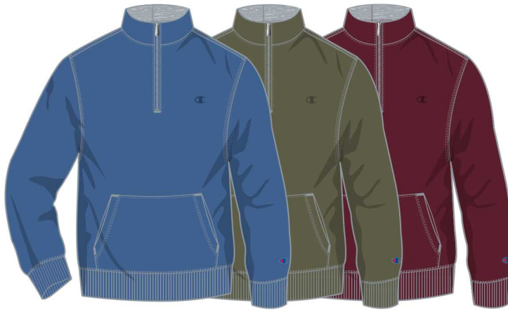
HONORABLE BLUE CARGO OLIVE MAROON