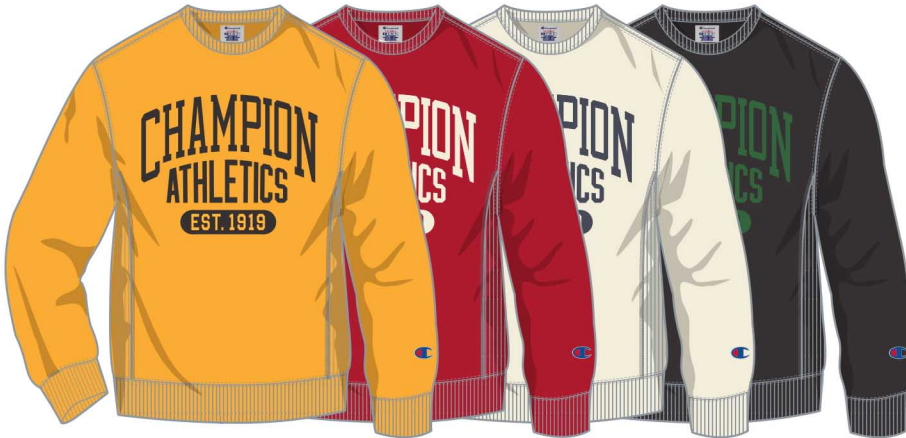
GOLD GLIMMER FIRE ROSATED RED WHITE ALABASTER GREY SCARF