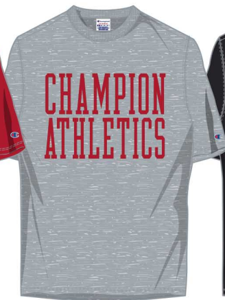
OXFORD HEATHER CH326 (549523)