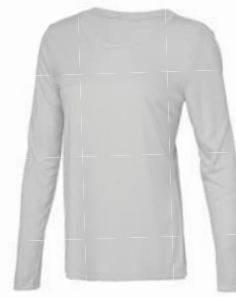
SPORT SILVER (SHOWN)