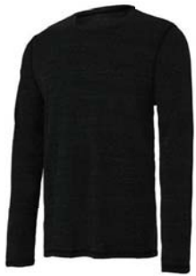
SOLID BLACK TRIBLEND

▶ 50% poly, 37.5% combed and ring-spun cotton, 12.5% rayon ▶ dry wicking ▶ antimicrobial ▶ set-in sleeves ▶ white and black bodies feature slightly contrasted stitching ▶ tear away label