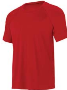
SPORT RED (SHOWN)