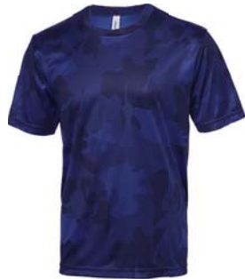
SPORT ROYAL LASER CAMO