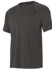
DARK GREY HEATHER