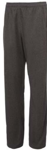
DARK GREY HEATHER