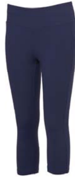
SPORT DARK NAVY (SHOWN)