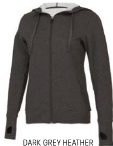
DARK GREY HEATHER (SHOWN)