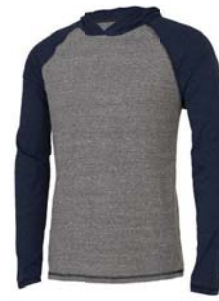
GREY HEATHER/ NAVY HEATHER TRIBLEND (SHOWN)