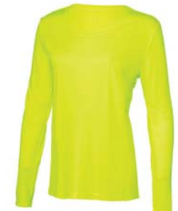
SPORT SAFETY YELLOW