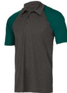
DARK GREY HEATHER/ SPORT FOREST