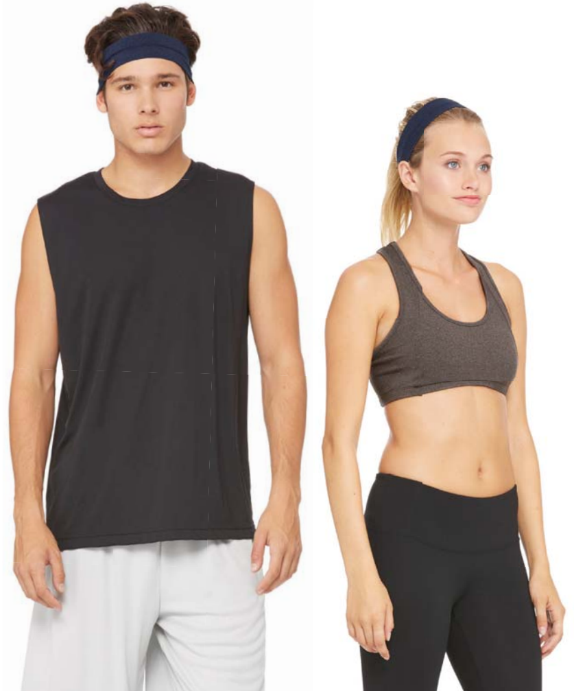
W7000 UNISEX HEADBAND Sizes: ONE SIZE