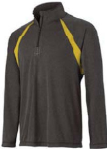
DARK GREY HEATHER/ SPORT ATHLETIC GOLD