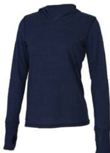
NAVY HEATHER TRIBLEND