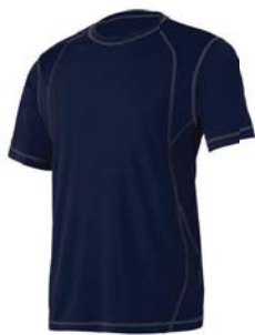
SPORT DARK NAVY/SLATE