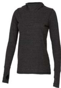
CHARCOAL HEATHER TRIBLEND