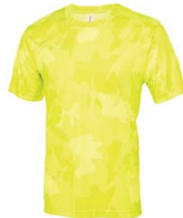
SPORT SAFETY YELLOW LASER CAMO