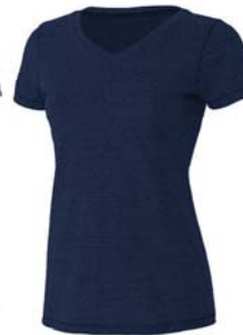
NAVY HEATHER TRIBLEND