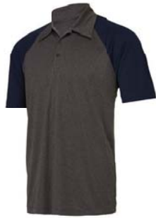
DARK GREY HEATHER/ SPORT DARK NAVY