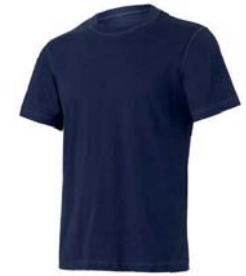
SPORT DARK NAVY