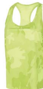
NEW SPORT SAFTY YELLOW LASER CAMO