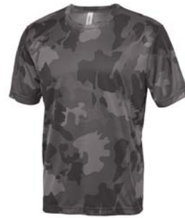
SPORT GRAPHITE LASER CAMO (SHOWN)