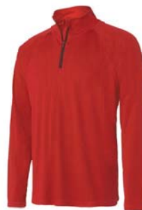
SPORT RED (SHOWN)