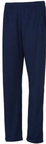
SPORT DARK NAVY