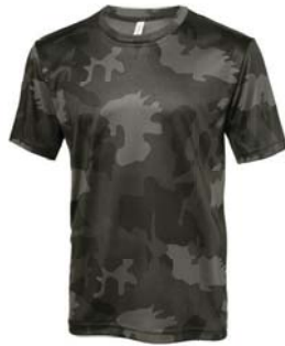
BLACK LASER CAMO

IN 5 BEST-SELLING MEN'S, WOMEN'S AND YOUTH STYLES