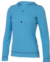
PACIFIC/SPORT DARK NAVY