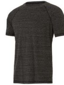
CHARCOAL HEATHER TRIBLEND