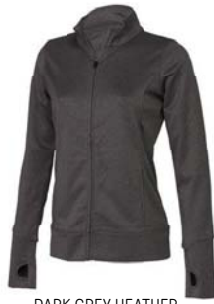
DARK GREY HEATHER (SHOWN)