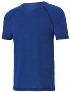
ROYAL HEATHER TRIBLEND