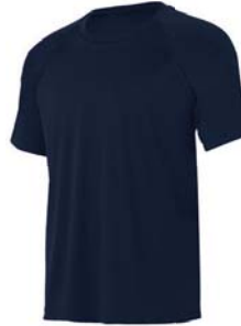
SPORT DARK NAVY