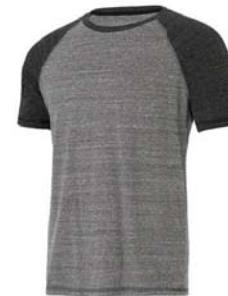
GREY HEATHER/ CHARCOAL HEATHER TRIBLEND