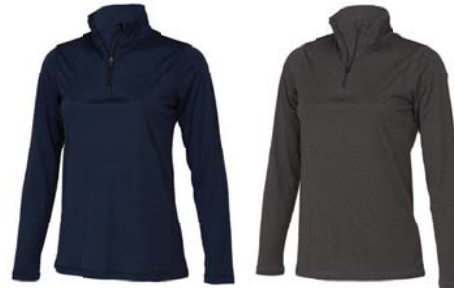
SPORT DARK NAVY