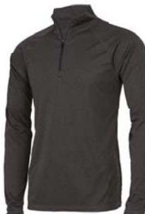
DARK GREY HEATHER