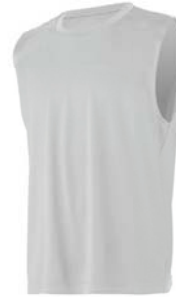
SPORT SILVER (SHOWN)