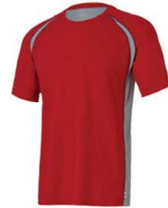
SPORT SCARLET RED/ GREY/SLATE