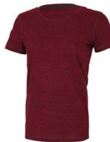
RED HEATHER TRIBLEND (SHOWN)