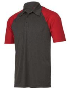
DARK GREY HEATHER/ SPORT RED