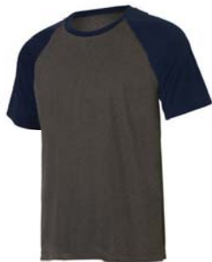
DARK GREY HEATHER/ SPORT DARK NAVY