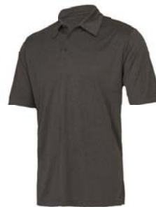
DARK GREY HEATHER (SHOWN)