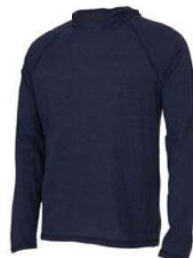
NAVY HEATHER TRIBLEND (SHOWN)