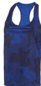
NEW SPORT ROYAL LASER CAMO