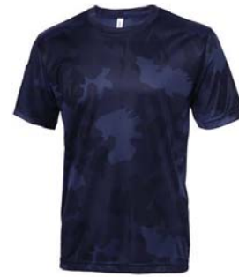
SPORT DARK NAVY LASER CAMO