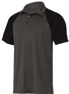
DARK GREY HEATHER/BLACK (SHOWING)