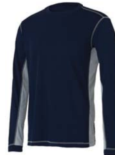
SPORT DARK NAVY/GREY