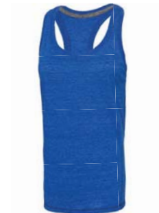
ROYAL HEATHER TRIBLEND