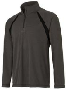
DARK GREY HEATHER/BLACK

▶ 100% poly interlock ▶ dry wicking ▶ antimicrobial ▶ raglan sleeves ▶ 1/4 front zip ▶ contrast color inset ▶ tear away label