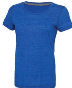
ROYAL HEATHER TRIBLEND