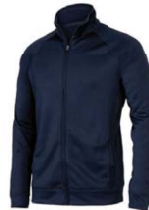
SPORT DARK NAVY