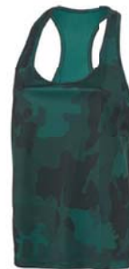
NEW SPORT FOREST LASRE CAMO