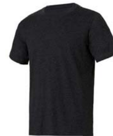
DARK GREY HEATHER