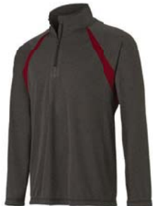
DARK GREY HEATHER/ SPORT MAROON