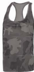
NEW SPORT GRAPHITE LASER CAMO