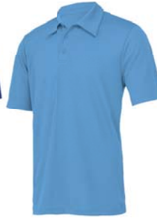
SPORT LIGHT BLUE