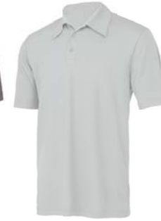
SPORT SILVER (SHOWN)