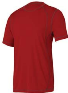
SPORT SCARLET RED/SLATE (SHOWN)