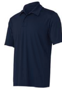
SPORT DARK NAVY