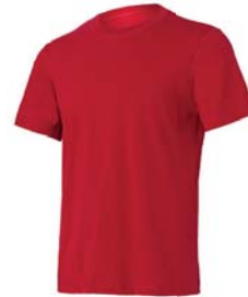
SPORT SCARLET RED (SHOWN)