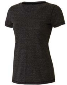
CHARCOAL HEATHER TRIBLEND (SHOWN)