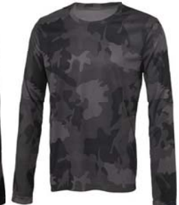
NEW SPORT GRAPHITE LASER CAMO