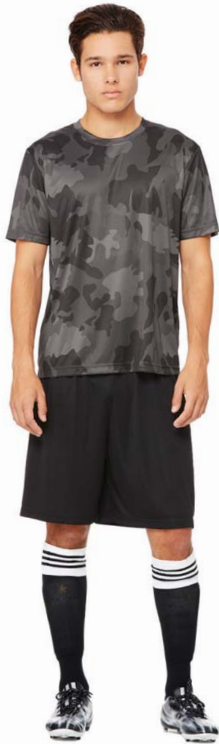
M1009 UNISEX PERFORMANCE SHORT SLEEVE TEE Sizes: XS- 4XL *See page 14