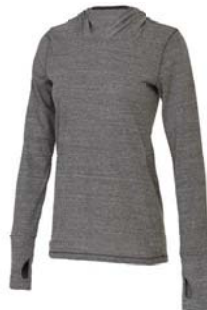
GREY HEATHER TRIBLEND (SHOWN)