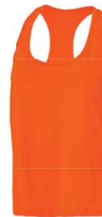
NEW SPORT ORANGE