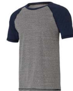
GREY HEATHER/ NAVY HEATHER TRIBLEND