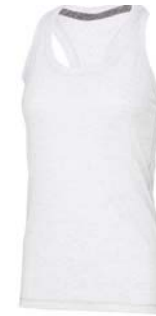
WHITE HEATHER TRIBLEND