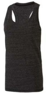
CHARCOAL HEATHER TRIBLEND