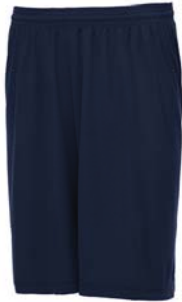
SPORT DARK NAVY