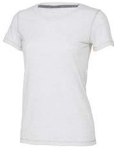
WHITE HEATHER TRIBLEND