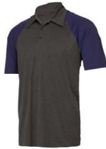
DARK GREY HEATHER/ SPORT NAVY