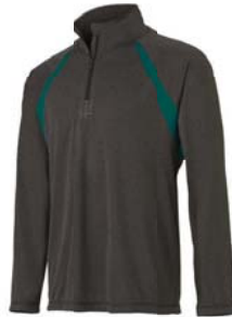
DARK GREY HEATHER/ SPORT FOREST