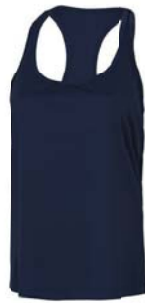
SPORT DARK NAVY