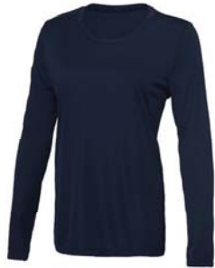
SPORT DARK NAVY