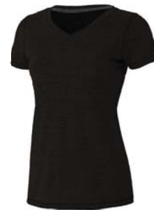
SOLID BLACK TRIBLEND