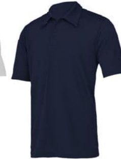
SPORT DARK NAVY