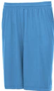
SPORT LIGHT BLUE (SHOWN)