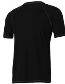
SOLID BLACK TRIBLEND