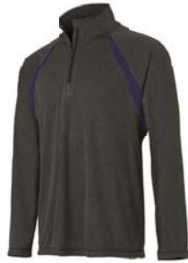
DARK GREY HEATHER/ SPORT NAVY