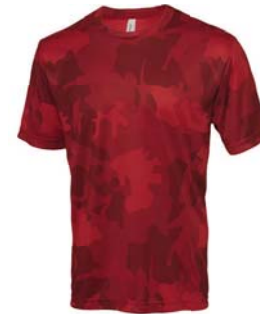
SPORT SCARLET RED LASER CAMO