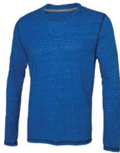
ROYAL HEATHER TRIBLEND