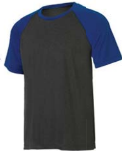
DARK GREY HEATHER/ SPORT ROYAL (SHOWN)