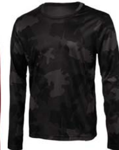
NEW BLACK LASER CAMO (SHOW)