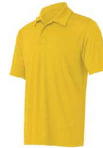
SPORT ATHLETIC GOLD