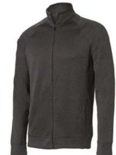
DARK GREY HEATHER (SHOWN)