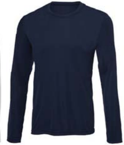
SPORT DARK NAVY