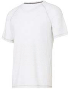
WHITE HEATHER TRIBLEND