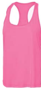
NEW SPORT CHARITY PINK