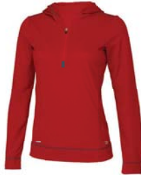
SPORT SCARLET RED/SLATE