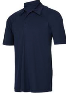
SPORT DARK NAVY