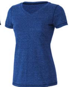
ROYAL HEATHER TRIBLEND