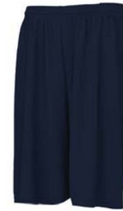
SPORT DARK NAVY