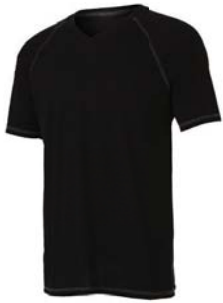
SOLID BLACK TRIBLEND

▶ 50% poly, 37.5% combed and ring-spun cotton, 12.5% rayon ▶ dry wicking ▶ antimicrobial ▶ raglan sleeves ▶ white and black bodies feature slightly contrasted stitching ▶ tear away label