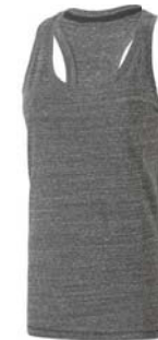
GREY HEATHER TRIBLEND