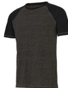
CHARCOAL HEATHER/ SOLID BLACK TRIBLEND