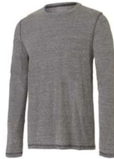
GREY HEATHER TRIBLEND