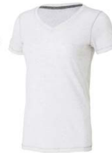
WHITE HEATHER TRIBLEND