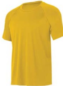
SPORT ATHLETIC GOLD