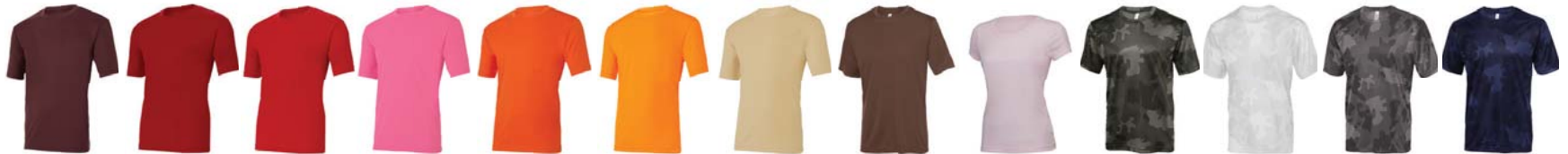
SPORT MAROON* SPORT SCARLET RED* SPORT RED* (SHOWN) SPORT CHARITY PINK* SPORT ORANGE* SPORT SAFETY ORANGE* SPORT VEGAS GOLD* NEW SPORT DARK BROWN* (M1009 ONLY) PINK (W1009 ONLY) NEW BLACK LASER CAMO NEW WHITE LASER CAMO (M1009 ONLY) NEW SPORT GRAPHITE LASER CAMO NEW SPORT DARK NAVY LASER CAMO (M1009 ONLY)