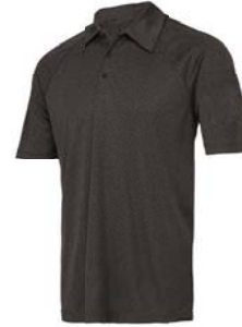
DARK GREY HEATHER