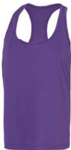
NEW SPORT PURPLE