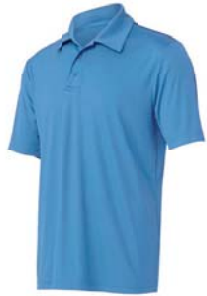
SPORT LIGHT BLUE