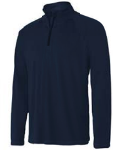
SPORT DARK NAVY