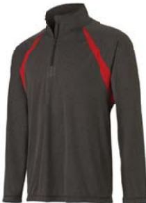
DARK GREY HEATHER/ SPORT RED (SHOWN)