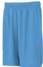
SPORT LIGHT BLUE