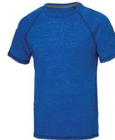
ROYAL HEATHER TRIBLEND