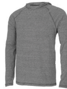
GREY HEATHER TRIBLEND