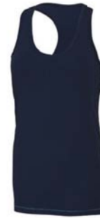
SPORT DARK NAVY/PACIFIC (SHOWN)