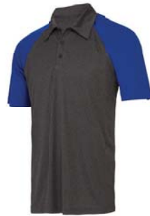
DARK GREY HEATHER/ SPORT ROYAL