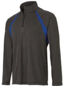
DARK GREY HEATHER/ SPORT ROYAL