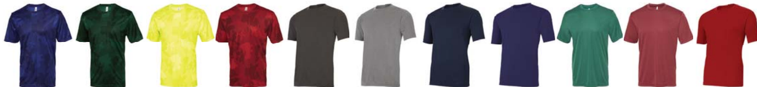
NEW SPORT ROYAL LASER CAMO (M1009 ONLY) NEW SPORT FOREST LASER CAMO (M1009 ONLY) NEW SPORT SAFETY YELLOW LASER CAMO (M1009 ONLY) NEW SPORT SCARLET RED LASER CAMO (M1009 ONLY) DARK GREY HEATHER ATHLETIC HEATHER HEATHER NAVY HEATHER ROYAL* NEW HEATHER FOREST (M1009 ONLY) NEW HEATHER MAROON (M1009 ONLY) HEATHER RED