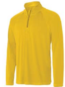
SPORT ATHLETIC GOLD