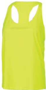
SPORT SAFETY YELLOW