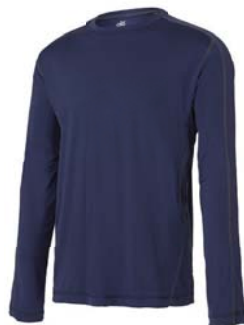
SPORT DARK NAVY/GREY (SHOWN)