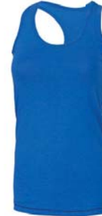
ROYAL/SPORT DARK NAVY