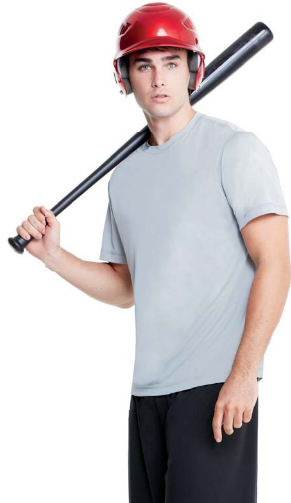
M1006 UNISEX SHORT SLEEVE TEE Sizes: XS-3XL