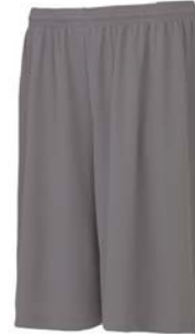
SPORT GRAPHITE (SHOWN)