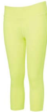
SPORT SAFETY YELLOW