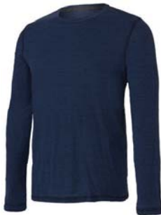
NAVY HEATHER TRIBLEND