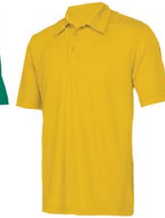
SPORT ATHLETIC GOLD