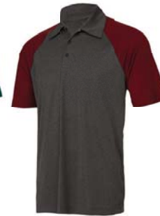
DARK GREY HEATHER/ SPORT MAROON