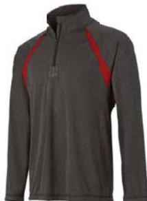
DARK GREY HEATHER/ SPORT SCARLET RED