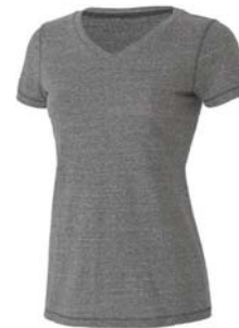
GREY HEATHER TRIBLEND