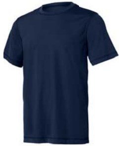
SPORT DARK NAVY