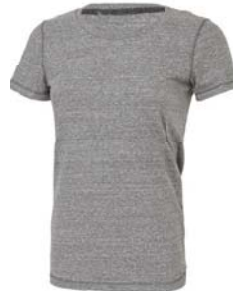
GREY HEATHER TRIBLEND