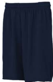
SPORT DARK NAVY