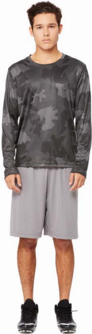
M3009 UNISEX PERFORMANCE LONG SLEEVE TEE Sizes: XS- 3XL *See page 22