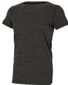
CHARCOAL HEATHER TRIBLEND