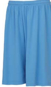
SPORT LIGHT BLUE