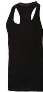
SOLID BLACK TRIBLEND (SHOWN)