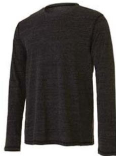
CHARCOAL HEATHER TRIBLEND (SHOWN)