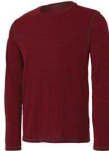
RED HEATHER TRIBLEND