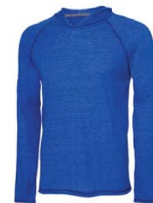
ROYAL HEATHER TRIBLEND