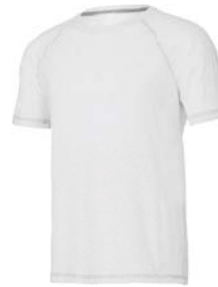
WHITE HEATHER TRIBLEND