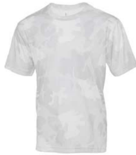
WHITE LASER CAMO