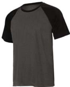
DARK GREY HEATHER / BLACK