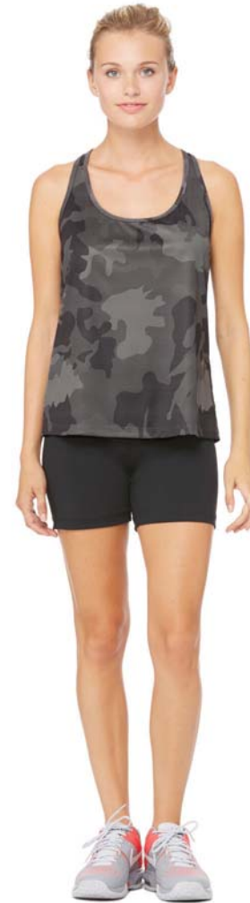
W2079 WOMEN'S PERFORMANCE RACERBACK TANK Sizes: XS- 3XL *See page 17