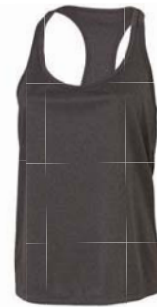
DARK GREY HEATHER