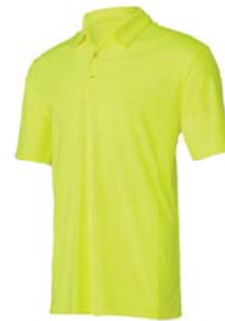
SPORT SAFETY YELLOW