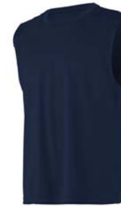
SPORT DARK NAVY