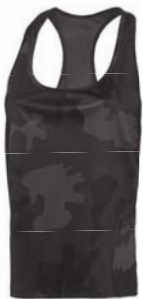
NEW BLACK LASER CAMO