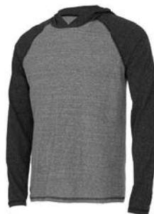
GREY HEATHER/CHARCOAL HEATHER TRIBLEND