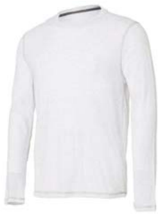
WHITE HEATHER TRIBLEND