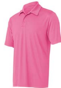
SPORT CHARITY PINK