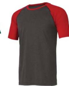
DARK GREY HEATHER / SPORT RED (SHOWN)