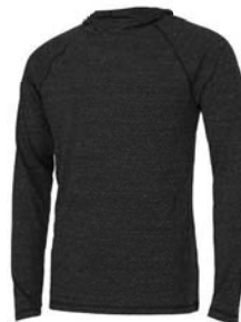
CHARCOAL HEATHER TRIBLEND