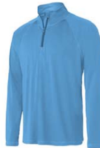
SPORT LIGHT BLUE