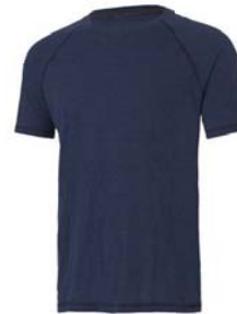
NAVY HEATHER TRIBLEND (SHOWN)