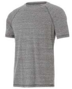
GREY HEATHER TRIBLEND