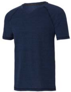
NAVY HEATHER TRIBLEND