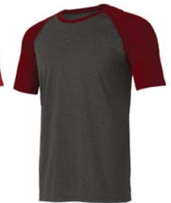
DARK GREY HEATHER/ SPORT MAROON