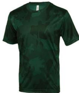
SPORT FOREST LASER CAMO