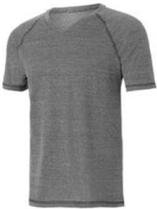
GREY HEATHER TRIBLEND (SHOWN)