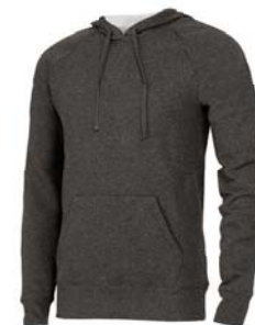
DARK GREY HEATHER (SHOWN)