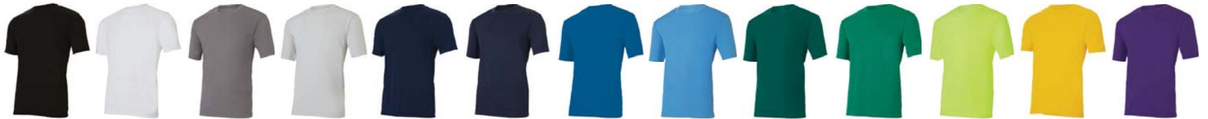
BLACK* WHITE* SPORT GRAPHITE* SPORT SILVER* SPORT DARK NAVY SPORT NAVY* SPORT ROYAL* SPORT LIGHT BLUE* SPORT FOREST* SPORT KELLY* SPORT SAFETY YELLOW* SPORT ATHLETIC GOLD* SPORT PURPLE*