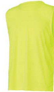
SPORT SAFETY YELLOW