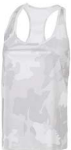
NEW WHITE LASER CAMO