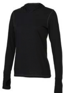
SOLID BLACK TRIBLEND