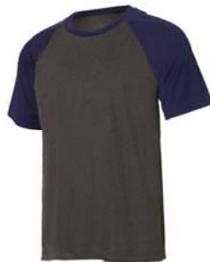
DARK GREY HEATHER/ SPORT NAVY