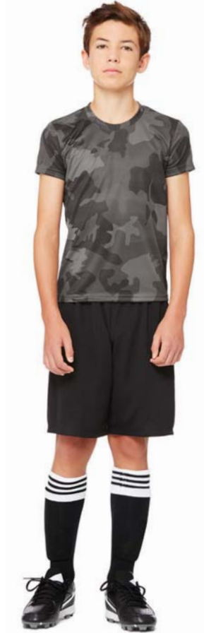
Y1009 YOUTH PERFORMANCE SHORT SLEEVE TEE Sizes: XS-XL *See page 14