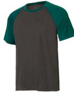
DARK GREY HEATHER/ SPORT FOREST