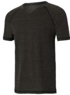
CHARCOAL HEATHER TRIBLEND