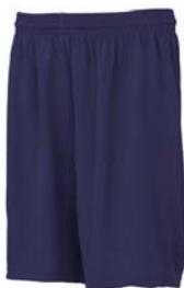
SPORT NAVY (SHOWN)