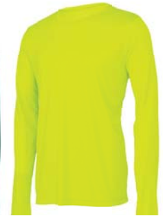
SPORT SAFETY YELLOW