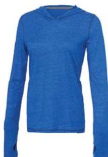
ROYAL HEATHER TRIBLEND