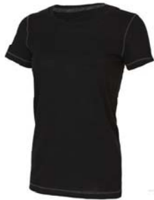
SOLID BLACK TRIBLEND

▶ 50% poly, 37.5% combed and ring-spun cotton, 12.5% rayon ▶ dry wicking ▶ antimicrobial ▶ set-in sleeves ▶ white and black bodies feature slightly contrasted stitching ▶ tear away label