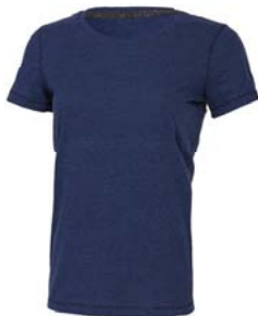
NAVY HEATHER TRIBLEND