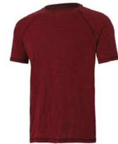
RED HEATHER TRIBLEND