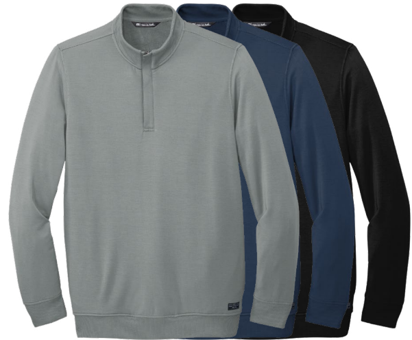
TRAVIS MATHEW Newport 1/4-Zip Fleece TM1MU419 Adult Sizes: S-3XL | 3 colors