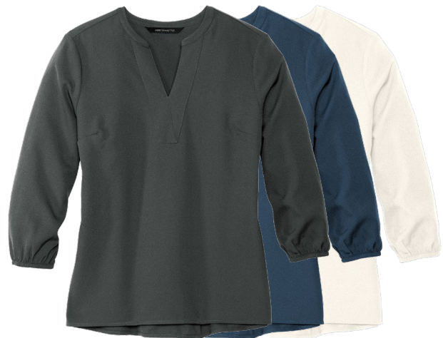
MERCER + METTLE Women's Stretch Crepe 3/4-Sleeve Blouse MM2011 Women's Sizes: XS-4XL | 5 colors