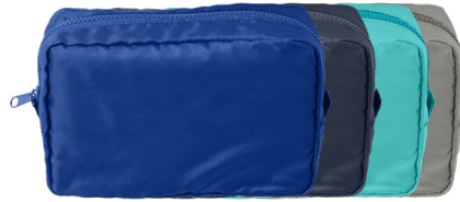
PORT AUTHORITY Stash Dimensional Pouch BG916 6 colors