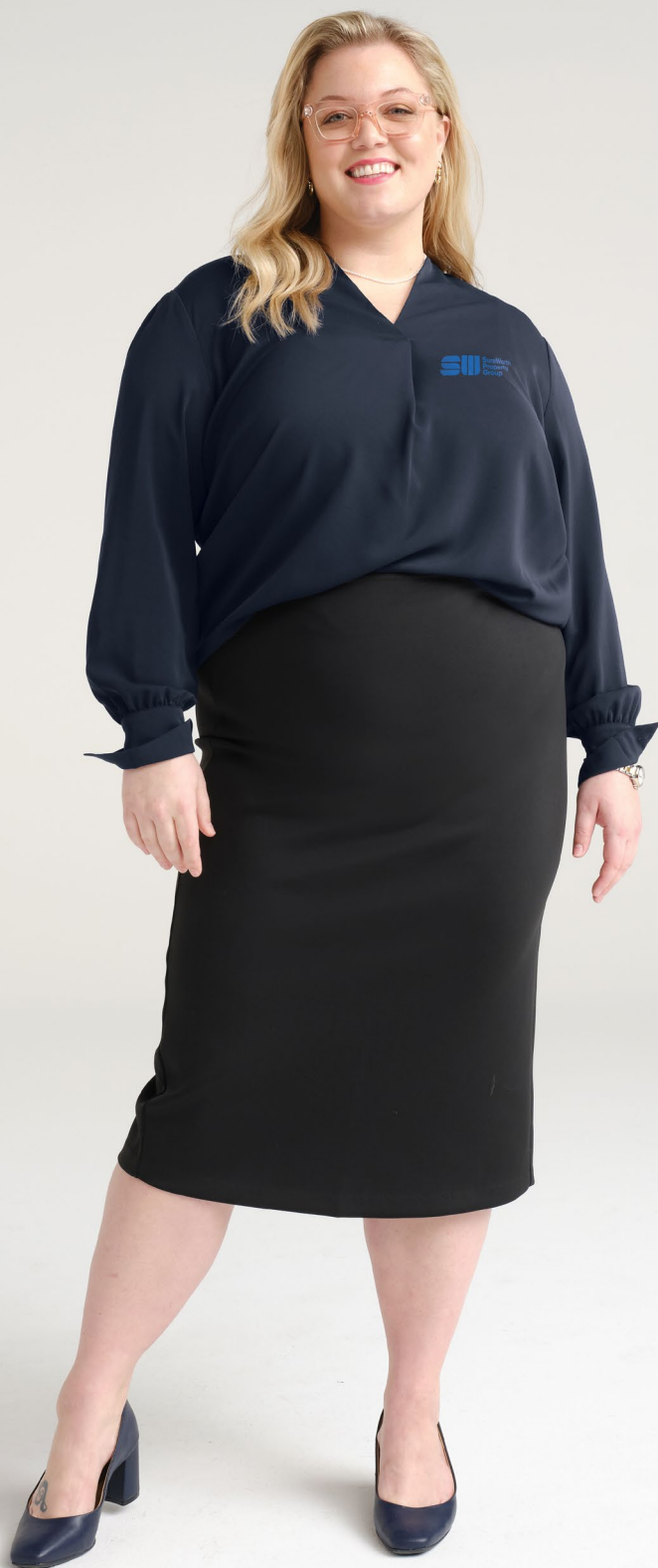
BROOKS BROTHERS Women's Open-Neck Satin Blouse BB18009 Women's Sizes: XS-4XL | 4 colors

Buttoned-up should not mean boring. A true classic look brings the team together with a sense of professionalism and pride.