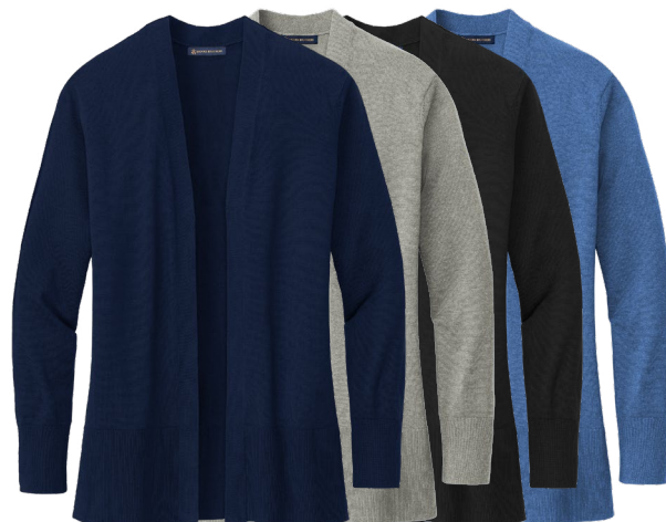
BROOKS BROTHERS Women's Cotton Stretch Long Cardigan Sweater BB18403 Women's Sizes: XS-4XL | 4 colors