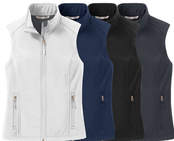
PORT AUTHORITY Ladies Core Soft Shell Vest L325 Women's Sizes: XS-4XL | 5 colors