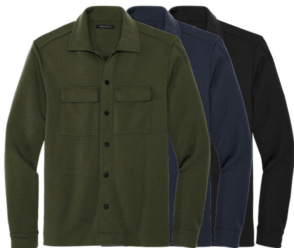
MERCER + METTLE Double-Knit Snap Front Jacket MM3004 Adult Sizes: XS-4XL | 3 colors