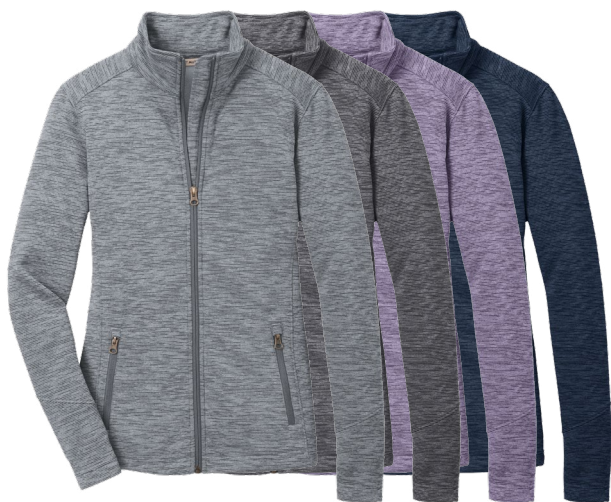
PORT AUTHORITY Ladies Digi Stripe Fleece Jacket L231 Women's Sizes: XS-4XL | 4 colors