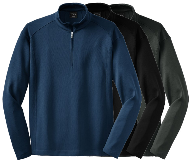
NIKE Sport Cover-Up 400099 Adult Sizes: XS-4XL | 3 colors