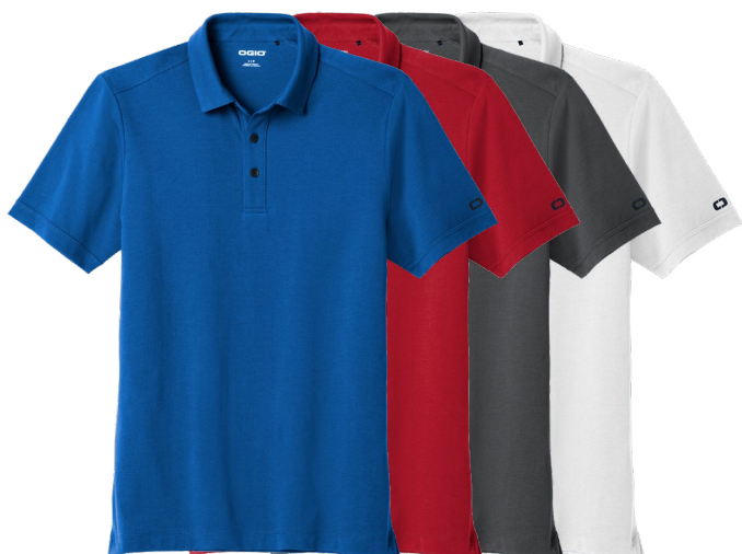
OGIO Limit Polo OG138 Adult Sizes: XS-4XL | 6 colors