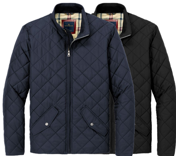
BROOKS BROTHERS Quilted Jacket BB18600 Adult Sizes: XS-4XL | 2 colors