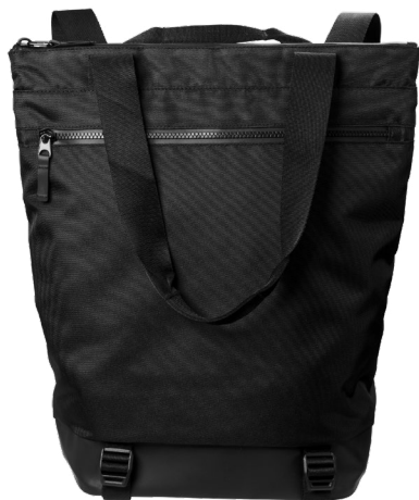
MERCER + METTLE Convertible Tote MMB202 1 color