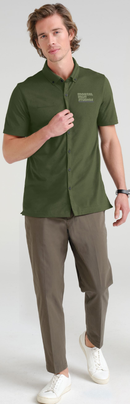
MERCER + METTLE Stretch Pique Full-Button Polo MM1006 Adult Sizes: XS-4XL | 7 colors