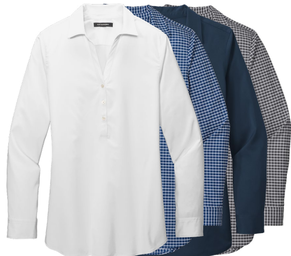
PORT AUTHORITY Ladies City Stretch Tunic LW680 Women's Sizes: XS-4XL | 5 colors