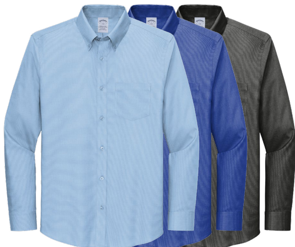
BROOKS BROTHERS Wrinkle Free Stretch Nailhead Shirt BB18002 Adult Sizes: XS-4XL | 6 colors