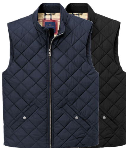
BROOKS BROTHERS Quilted Vest BB18602 Adult Sizes: XS-4XL | 2 colors