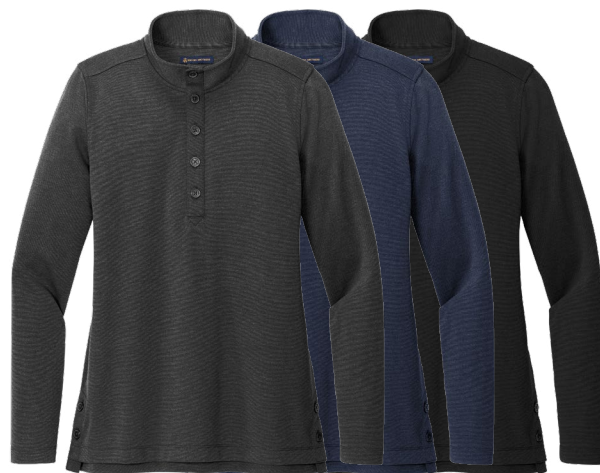
BROOKS BROTHERS Women's Mid-Layer Stretch 1/2 Button BB18203 Women's Sizes: XS-4XL | 3 colors