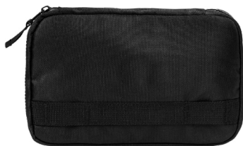
MERCER + METTLE Utility Case MMB700 1 color