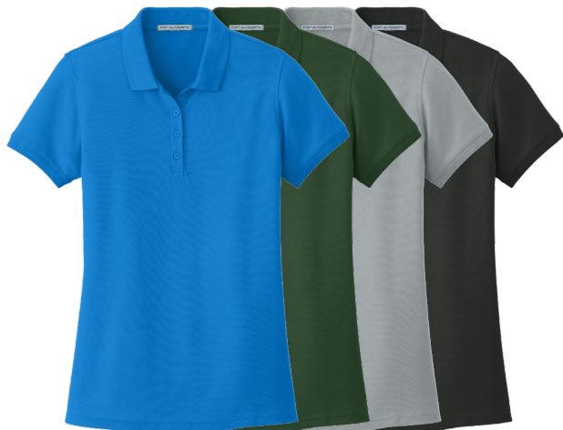
PORT AUTHORITY Ladies Core Classic Pique Polo L100 Women's Sizes: XS-6XL | 13 colors