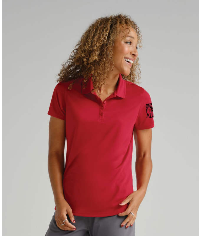
PORT AUTHORITY Ladies Dry Zone UV Micro-Mesh Polo LK110 Women's Sizes: XS-4XL | 16 colors