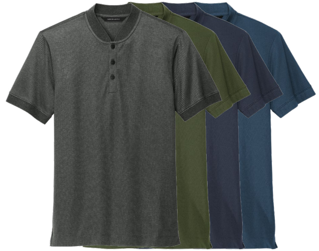
MERCER + METTLE Stretch Pique Henley MM1008 Adult Sizes: XS-4XL | 7 colors