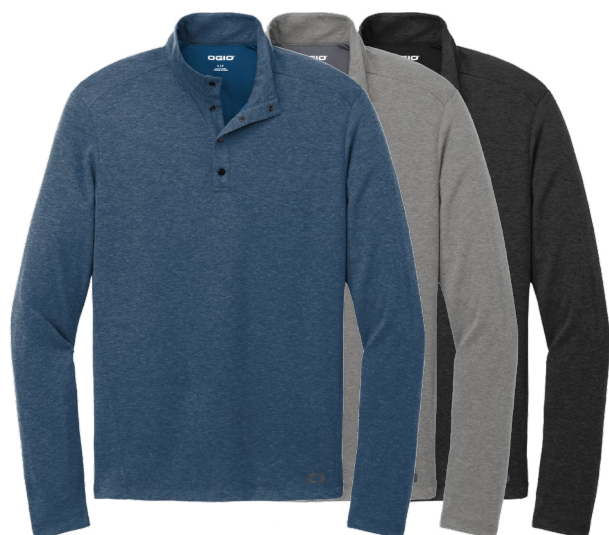
OGIO Command 1/4-Snap OG151 Adult Sizes: XS-4XL | 3 colors