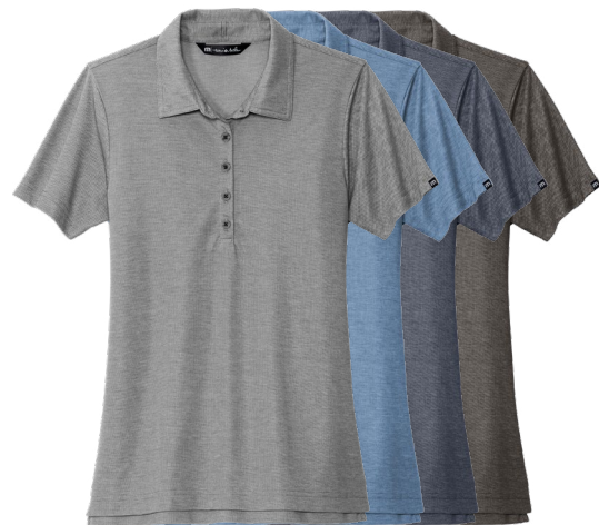
TRAVISMATHEW Ladies Oceanside Heather Polo TM1WW002 Women's Sizes: S-2XL | 6 colors