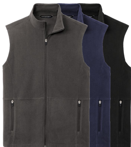
PORT AUTHORITY Accord Microfleece Vest F152 Adult Sizes: XS-4XL | 3 colors