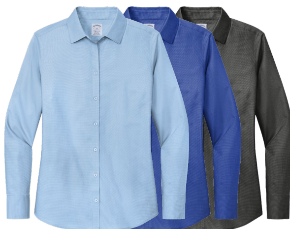
BROOKS BROTHERS Wrinkle Free Women's Stretch Nailhead Shirt BB18003 Women's Sizes: XS-4XL | 6 colors