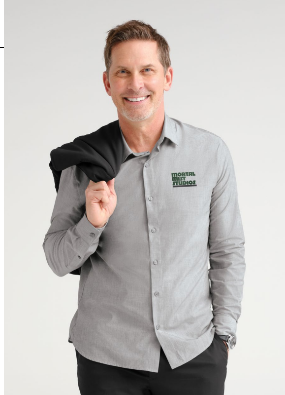
MERCER + METTLE Long Sleeve Stretch Woven Shirt MM2000 Adult Sizes: XS-4XL | 7 colors Worn with TM1MW453