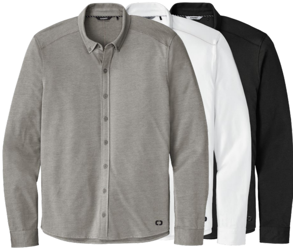
OGIO Code Stretch Long Sleeve Button-Up OG145 Adult Sizes: XS-4XL | 3 colors