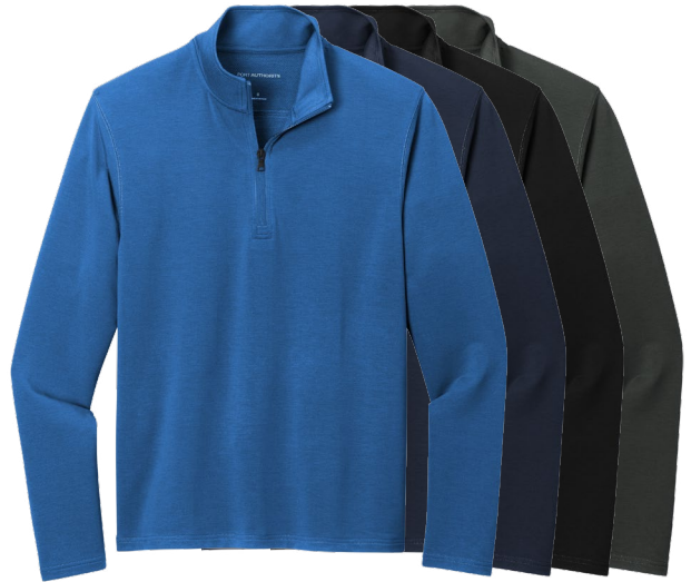
PORT AUTHORITY Microterry 1/4-Zip Pullover K825 Adult Sizes: XS-4XL | 4 colors