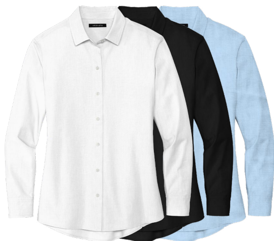
MERCER + METTLE Women's Long Sleeve Stretch Woven Shirt MM2001 Women's Sizes: XS-4XL | 4 colors