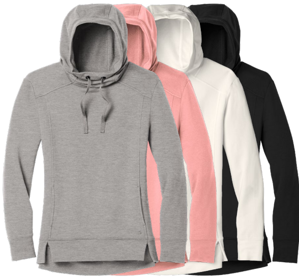
OGIO Ladies Luuma Pullover Fleece Hoodie LOG810 Women's Sizes: XS-4XL | 4 colors