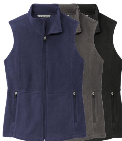
PORT AUTHORITY Ladies Accord Microfleece Vest L152 Women's Sizes: XS-4XL | 3 colors