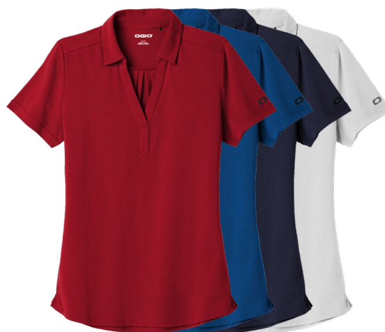
OGIO Ladies Limit Polo LOG138 Women's Sizes: XS-4XL | 7 colors