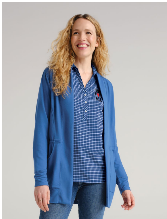
PORT AUTHORITY Ladies Microterry Cardigan LK825 Women's Sizes: XS-4XL | 4 colors Worn with LW680