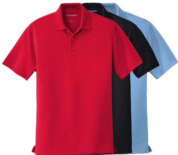
PORT AUTHORITY Dry Zone UV Micro-Mesh Polo K110 Adult Sizes: XS-6XL | 16 colors