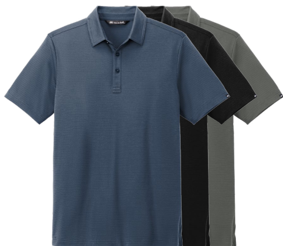
TRAVISMATHEW Bayfront Solid Polo TM1MY399 Adult Sizes: S-3XL | 4 colors