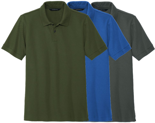
MERCER + METTLE Stretch Heavyweight Pique Polo MM1000 Adult Sizes: XS-4XL | 8 colors