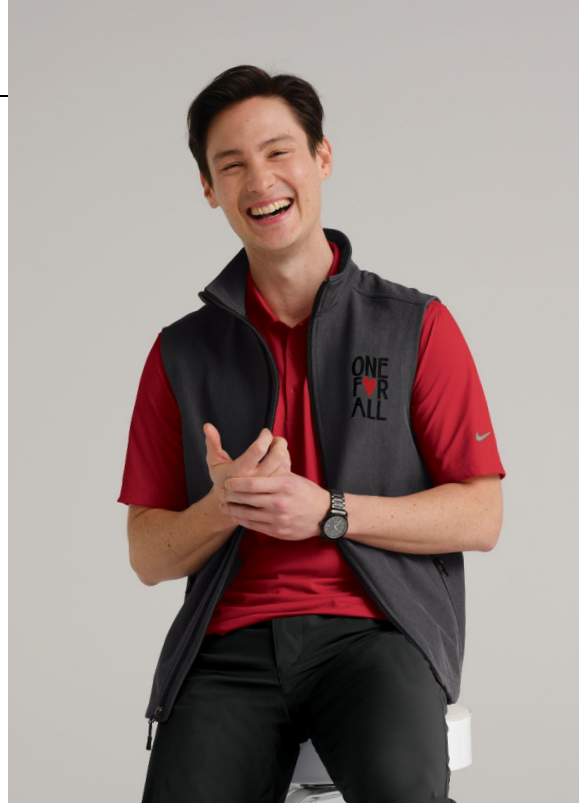
PORT AUTHORITY Core Soft Shell Vest J325 Adult Sizes: XS-4XL | 4 colors Worn with 883681