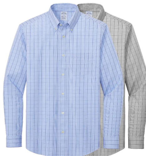
BROOKS BROTHERS Wrinkle Free Stretch Patterned Shirt BB18008 Adult Sizes: XS-4XL | 2 colors

Buttoned-up should not mean boring. A true classic look brings the team together with a sense of professionalism and pride.