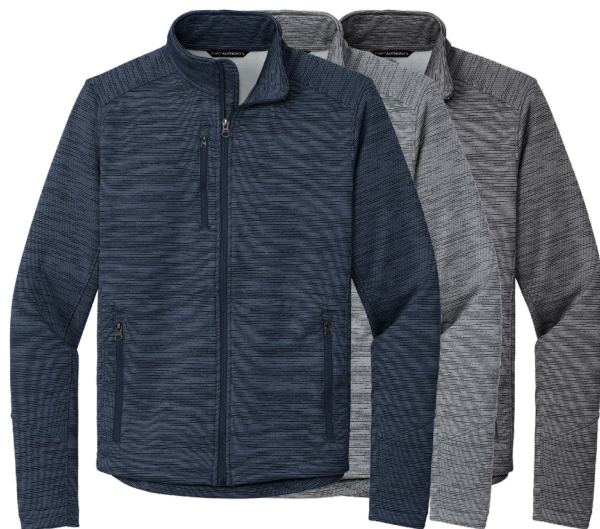
PORT AUTHORITY Digi Stripe Fleece Jacket F231 Adult Sizes: XS-4XL | 3 colors