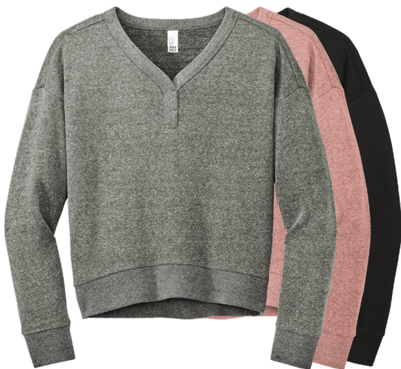
DISTRICT Ladies Perfect Tri Fleece V-Neck Sweatshirt DT1312 Women's Sizes: XS-4XL | 5 colors