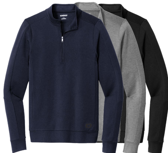
OGIO Luuma 1/2-Zip Fleece OG813 Adult Sizes: XS-4XL | 3 colors