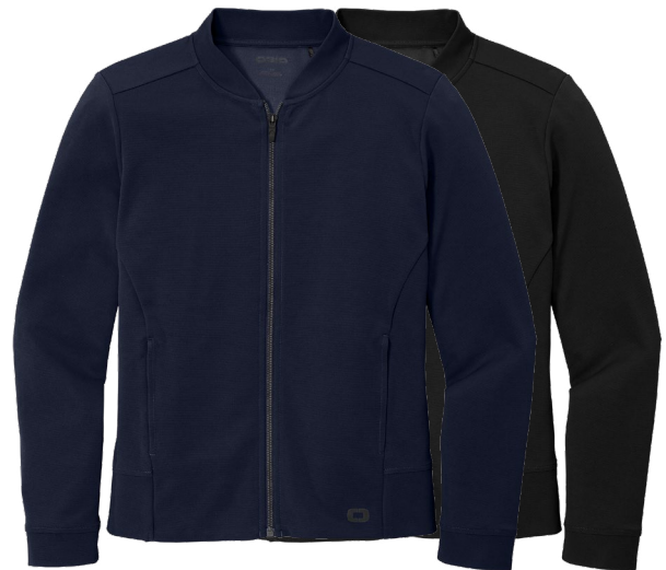
OGIO Ladies Hinge Full-Zip LOG820 Women's Sizes: XS-4XL | 3 colors