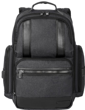
BROOKS BROTHERS Grant Backpack BB18820 1 color