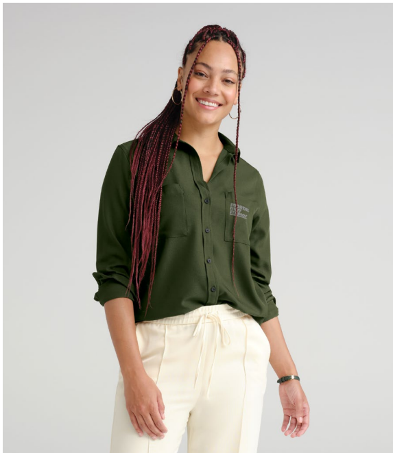
MERCER + METTLE Women's Stretch Crepe Long Sleeve Camp Blouse MM2013 Women's Sizes: XS-4XL | 4 colors