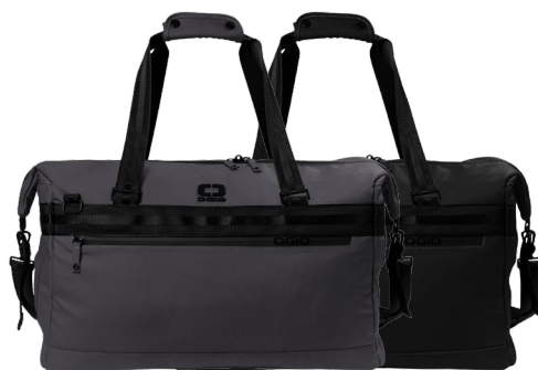
OGIO Commuter Duffel 411098 2 colors