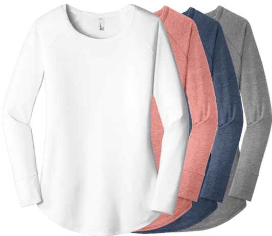
DISTRICT Women's Perfect Tri Long Sleeve Tunic Tee DT132L Women's Sizes: XS-4XL | 5 colors

Uplift the whole team with outfits that speak to a cohesive vision, a laid-back attitude and a clear focus on accomplishing great work together.