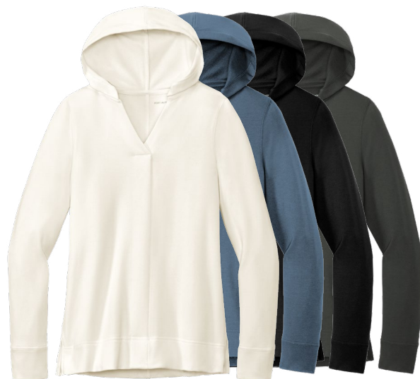
PORT AUTHORITY Ladies Microterry Pullover Hoodie LK826 Women's Sizes: XS-4XL | 4 colors