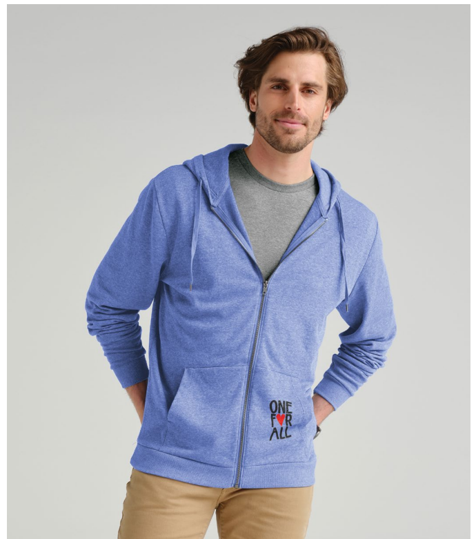
DISTRICT Perfect Tri Fleece Full-Zip Hoodie DT1302 Adult Sizes: XS-4XL | 6 colors Worn with DM130