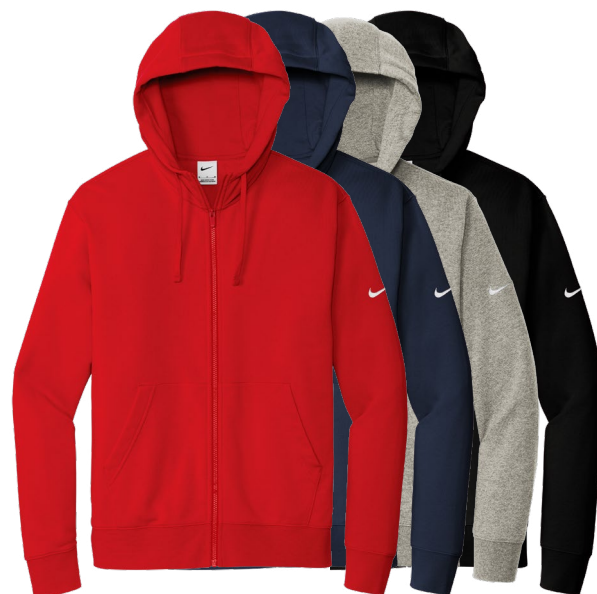
NIKE Club Fleece Sleeve Swoosh Full-Zip Hoodie NKDR1513 Adult Sizes: XS-4XL | 6 colors