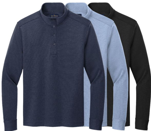
BROOKS BROTHERS Mid-Layer Stretch 1/2 Button BB18202 Adult Sizes: XS-4XL | 5 colors