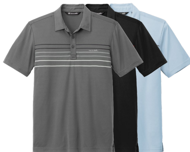
TRAVISMATHEW Coto Performance Chest Stripe Polo TM1MY400 Adult Sizes: S-3XL | 3 colors