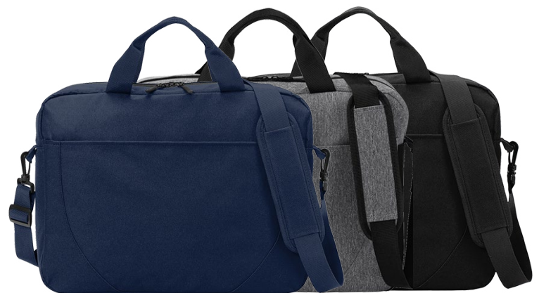
PORT AUTHORITY Access Briefcase BG318 3 colors