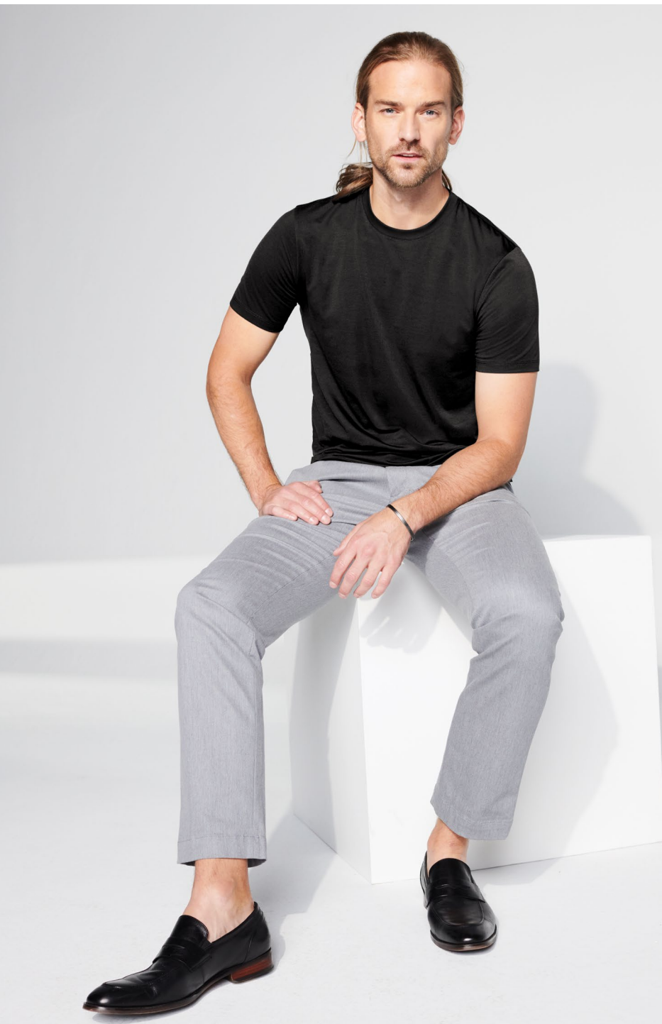
STRETCH JERSEY CREW