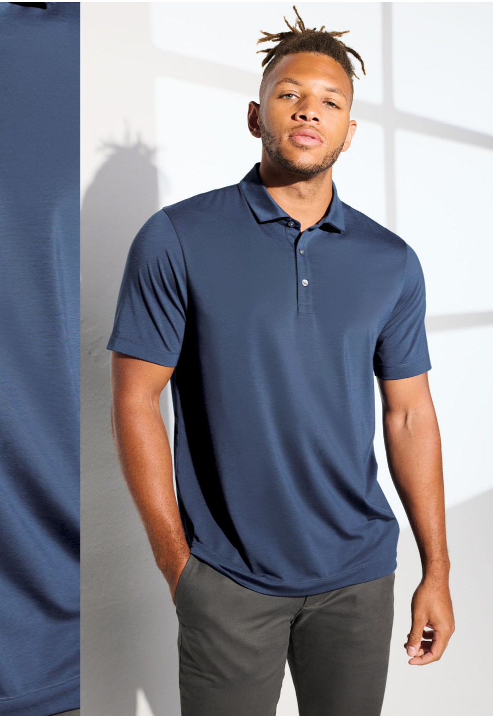
STRETCH JERSEY POLO