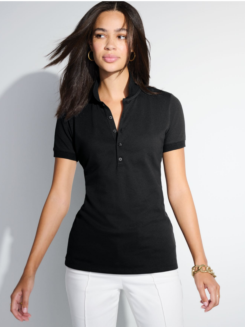
WOMEN'S STRETCH HEAVYWEIGHT PIQUE POLO MM1001