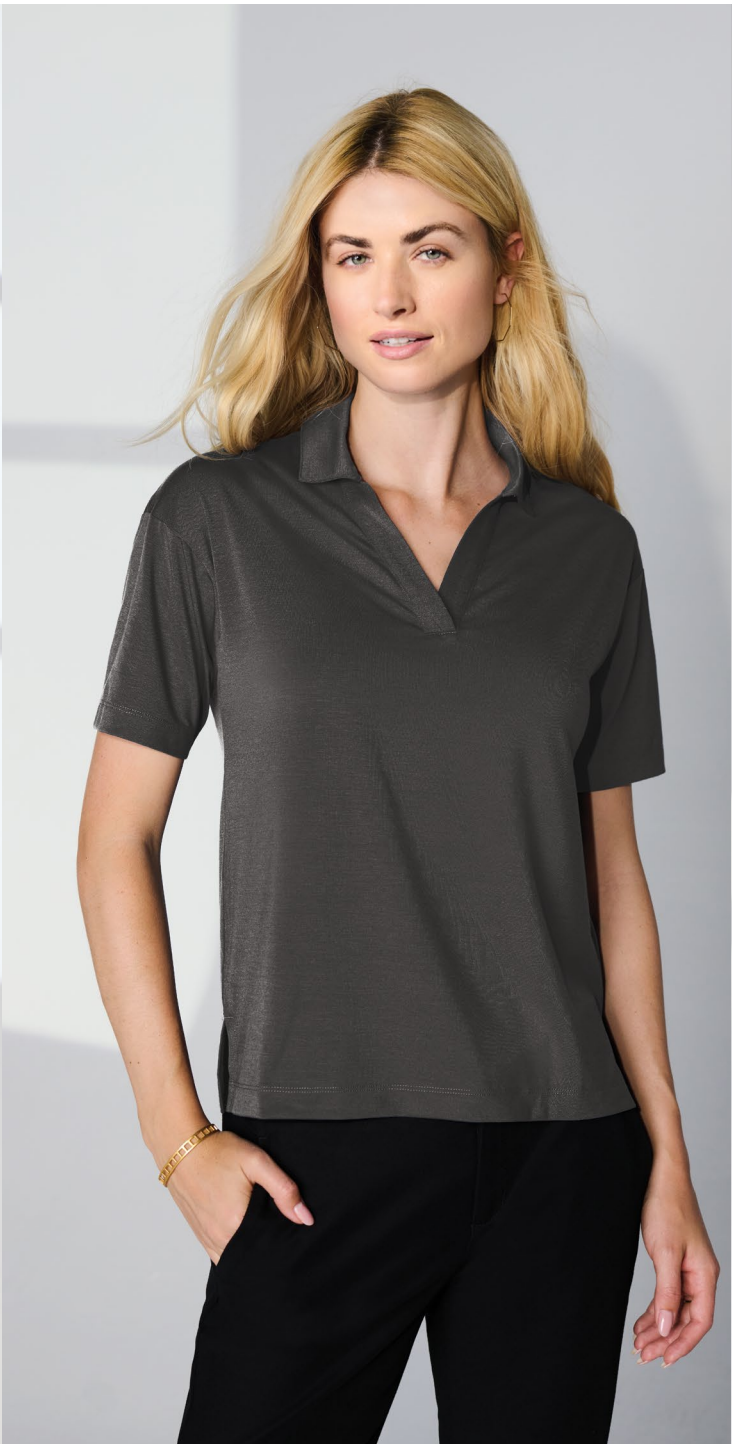
WOMEN'S STRETCH JERSEY POLO