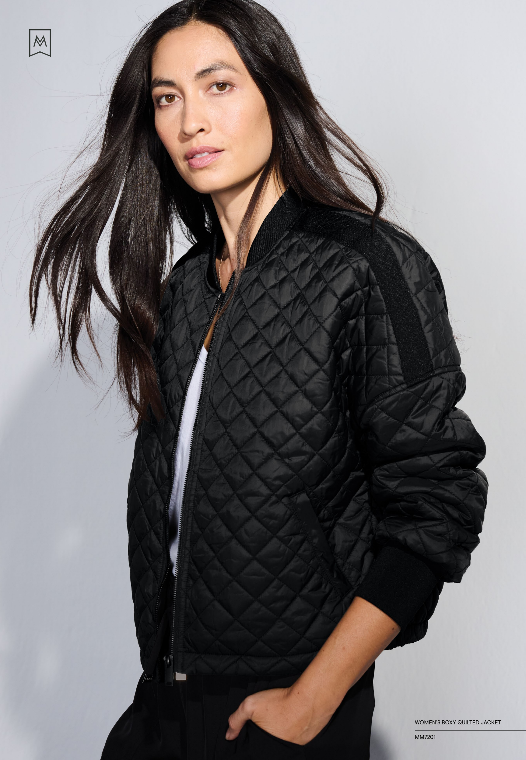
WOMEN'S BOXY QUILTED JACKET