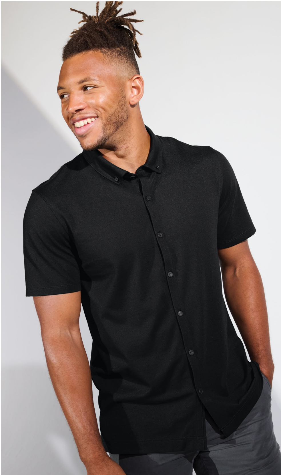
STRETCH PIQUE FULL-BUTTON POLO