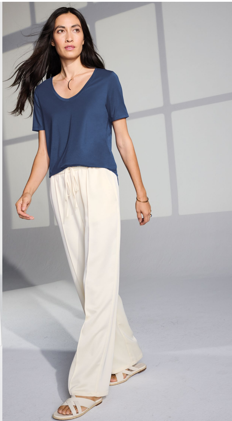
WOMEN'S STRETCH JERSEY RELAXED SCOOP