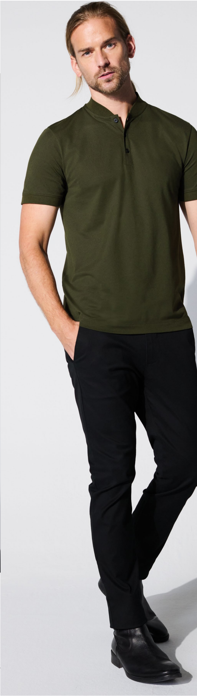
STRETCH PIQUE HENLEY