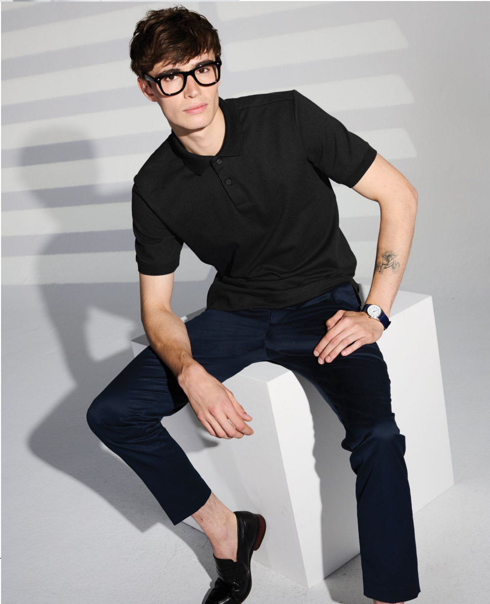
STRETCH HEAVYWEIGHT PIQUE POLO MM1000