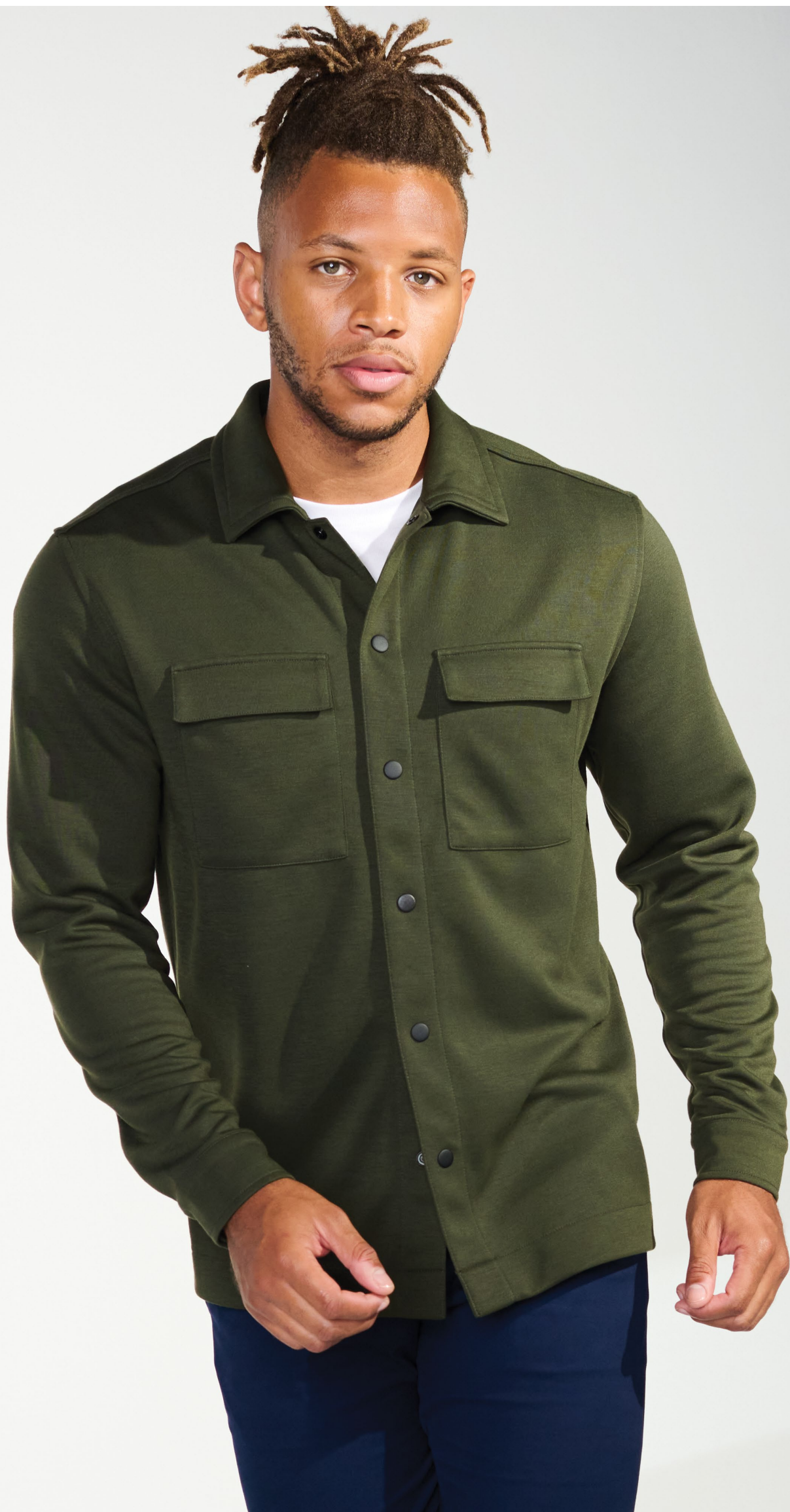
DOUBLE-KNIT SNAP FRONT JACKET