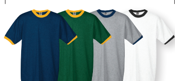
NAVY/ GOLD 302 DARK GREEN/ GOLD 442 ATHLETIC HEATHER/ NAVY 157 WHITE/ BLACK 226