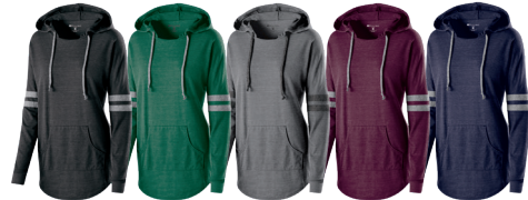
VINTAGE BLACK/ VINTAGE GREY M44