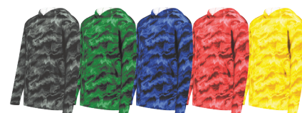
SHOCKWAVE GRAPHITE 86V SHOCKWAVE DK GREEN 87V SHOCKWAVE NAVY 88V SHOCKWAVE SCARLET 70V SHOCKWAVE GOLD 71V