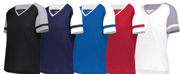
BLACK/ GREY HEATHER 92T