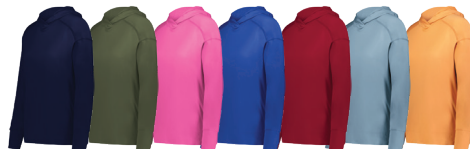
NAVY 065 OLIVE 039 ORCHID 47V ROYAL 060 SCARLET 083 STORM 932 TERRACOTTA J46