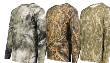
MO ELEMENTS WAKEFORM GALE 88T