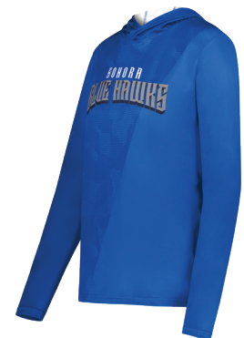
Watercolor Camo II