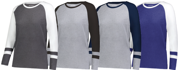
CARBON HEATHER/ WHITE 99E