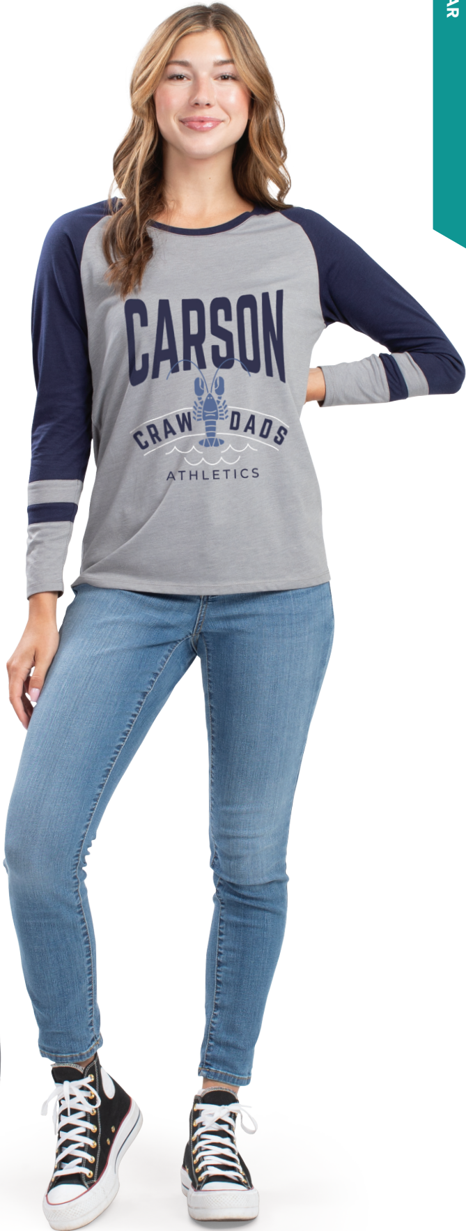
WHITE/ GREY HEATHER 91T