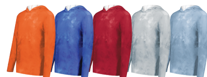
ORANGE CLOUD PRINT 68T ROYAL CLOUD PRINT 63T SCARLET CLOUD PRINT 66T SILVER CLOUD PRINT 69T STORM CLOUD PRINT 70T