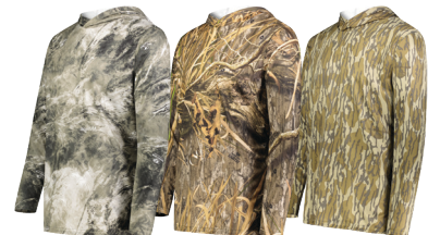
MO ELEMENTS WAKEFORM GALE 88T