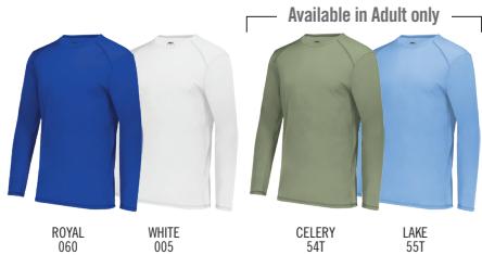
ROYAL 060 WHITE 005 CELERY 54T LAKE 55T