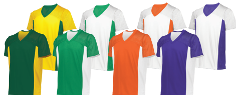
DARK GREEN/ GOLD 442