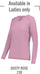
DUSTY ROSE 23D