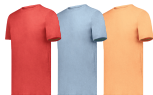
SCARLET HEATHER T20