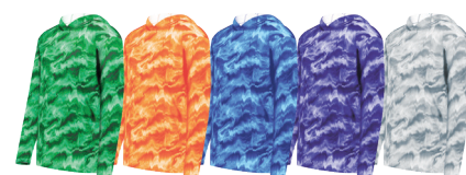
SHOCKWAVE KELLY 72V SHOCKWAVE ORANGE 73V SHOCKWAVE ROYAL 75V SHOCKWAVE PURPLE 74V SHOCKWAVE SILVER 77V

Due to dyes used for creating this garment, dye migration is likely if screen printing or using certain heat transfers without preventive steps. You are advised to consult your Screen Print ink or Heat Transfer provider before decorating if you are unsure of the proper steps for decoration.