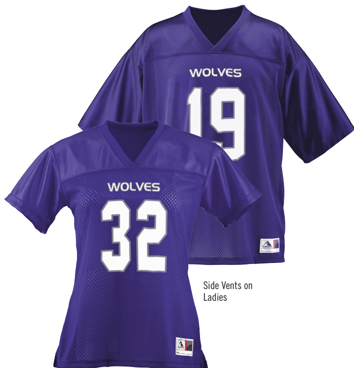
Side Vents on Ladies