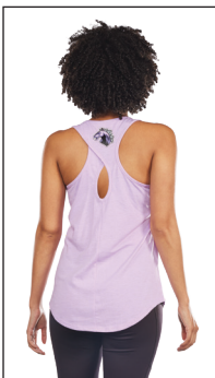
Racerback with keyhole