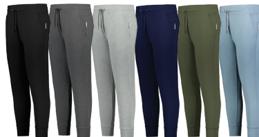
BLACK 080 CHARCOAL HEATHER E83 GREY HEATHER 013 NAVY 065 OLIVE 039 STORM 932