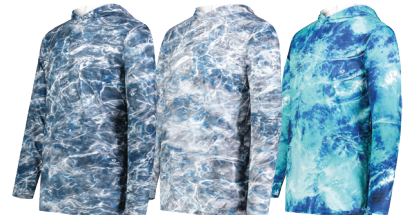
MO ELEMENTS AGUA BLACKFIN 86T