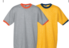
ATHLETIC HEATHER/ ORANGE 188 GOLD/ NAVY 241