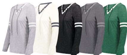
ATHLETIC HEATHER/WHITE 152 BIRCH HEATHER/CARBON HEATHER 112 BLACK HEATHER/WHITE 56N CARBON HEATHER/ATHLETIC HEATHER 019 DARK GREEN HEATHER/WHITE 86E