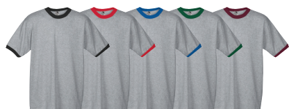
ATHLETIC HEATHER/ BLACK 158 ATHLETIC HEATHER/ RED 154 ATHLETIC HEATHER/ ROYAL 156 ATHLETIC HEATHER/ D. GREEN 153 ATHLETIC HEATHER/ MAROON 155