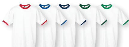
WHITE/ RED 225 WHITE/ ROYAL 220 WHITE/ NAVY 221 WHITE/ DARK GREEN 232 WHITE/ KELLY 222