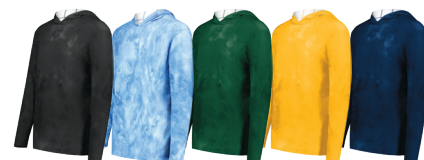
BLACK CLOUD PRINT 65T COL BLUE CLOUD PRINT 67T DK GREEN CLOUD PRINT 62T GOLD CLOUD PRINT 61T NAVY CLOUD PRINT 64T