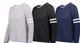
ATHLETIC HEATHER/WHITE 152 BLACK HEATHER/WHITE 56N NAVY HEATHER/WHITE 57N