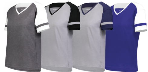
CARBON HEATHER/ WHITE 99E