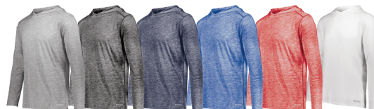
ATHLETIC GREY HEATHER 55M