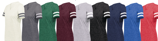
BIRCH HEATHER/CARBON HEATHER 112 CARBON HEATHER/ATHLETIC HEATHER 019 DARK GREEN HEATHER/WHITE 86E MAROON HEATHER/WHITE 61N ATHLETIC HEATHER/WHITE 152 BLACK HEATHER/WHITE 56N NAVY HEATHER/WHITE 57N ROYAL HEATHER/WHITE 58N SCARLET HEATHER/WHITE 59N