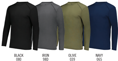
BLACK 080 IRON 980 OLIVE 039 NAVY 065