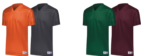
BURNT ORANGE BOR