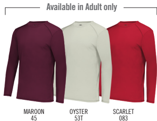
MAROON 45 OYSTER 53T SCARLET 083