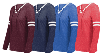
MAROON HEATHER/WHITE 61N NAVY HEATHER/WHITE 57N ROYAL HEATHER/WHITE 58N SCARLET HEATHER/WHITE 59N