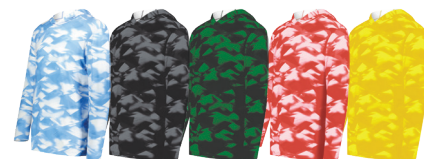
GLACIER COL BLUE 76V GLACIER BLACK 87V GLACIER DK GREEN 88V GLACIER SCARLET 86V GLACIER GOLD 85V