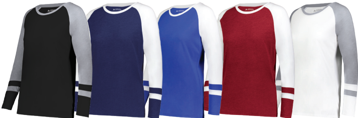
BLACK/ GREY HEATHER 92T