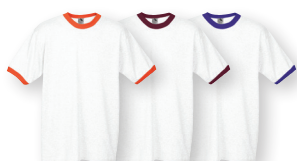
WHITE/ ORANGE 227 WHITE/ MAROON 224 WHITE/ PURPLE 231