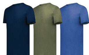
NAVY HEATHER U22