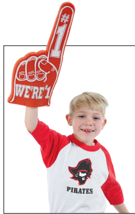
Available in Toddler (422)