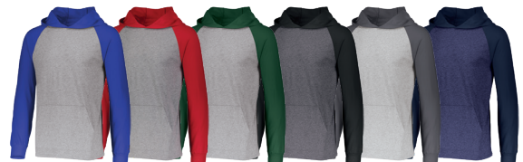
OXFORD/ ROYAL 9UF