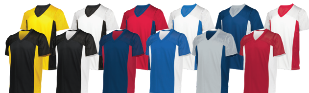
BLACK/ GOLD 421