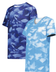
COORDINATING TEES 222596 | 222696 | 222796