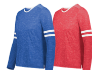
ROYAL HEATHER/WHITE 58N SCARLET HEATHER/WHITE 59N