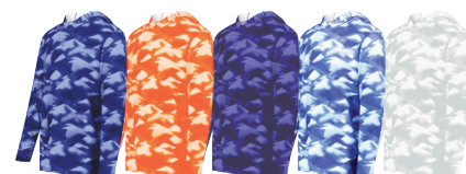
GLACIER NAVY 84V GLACIER ORANGE 83V GLACIER PURPLE 82V GLACIER ROYAL 81V GLACIER SILVER 80V