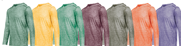
DARK GREEN HEATHER V97