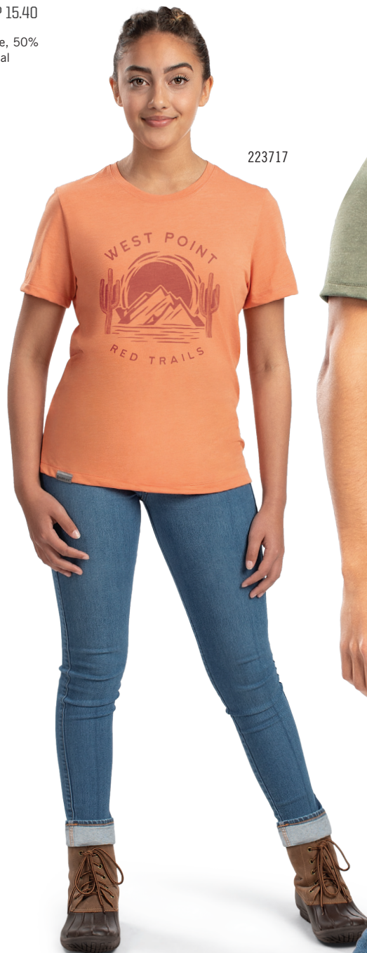
TERRACOTTA HEATHER 52V