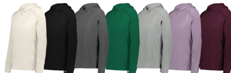
BIRCH 907 BLACK 080 CHARCOAL HEATHER 083 DARK GREEN 035 GREY HEATHER 013 LAVENDER J63 MAROON 745