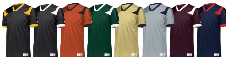
BLACK/ GOLD 9XM