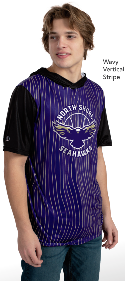
Wavy Vertical Stripe