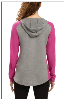
Dropped tail on Ladies