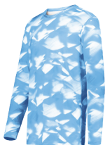
COORDINATING LONG SLEEVE TEE 222597 | 222697