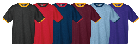
BLACK/ GOLD 421 RED/ BLACK 407 NAVY/ RED 307 MAROON/ GOLD 389 LIGHT BLUE/ NAVY 461 PURPLE/ GOLD 495