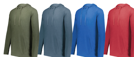
OLIVE HEATHER 49N