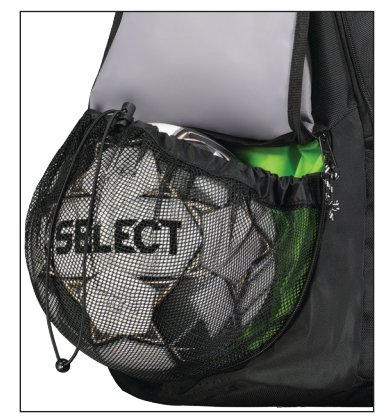
Front pocket with corded zipper pull with hidden inside mesh ball holder that fits volleyball, soccer ball, or basketball